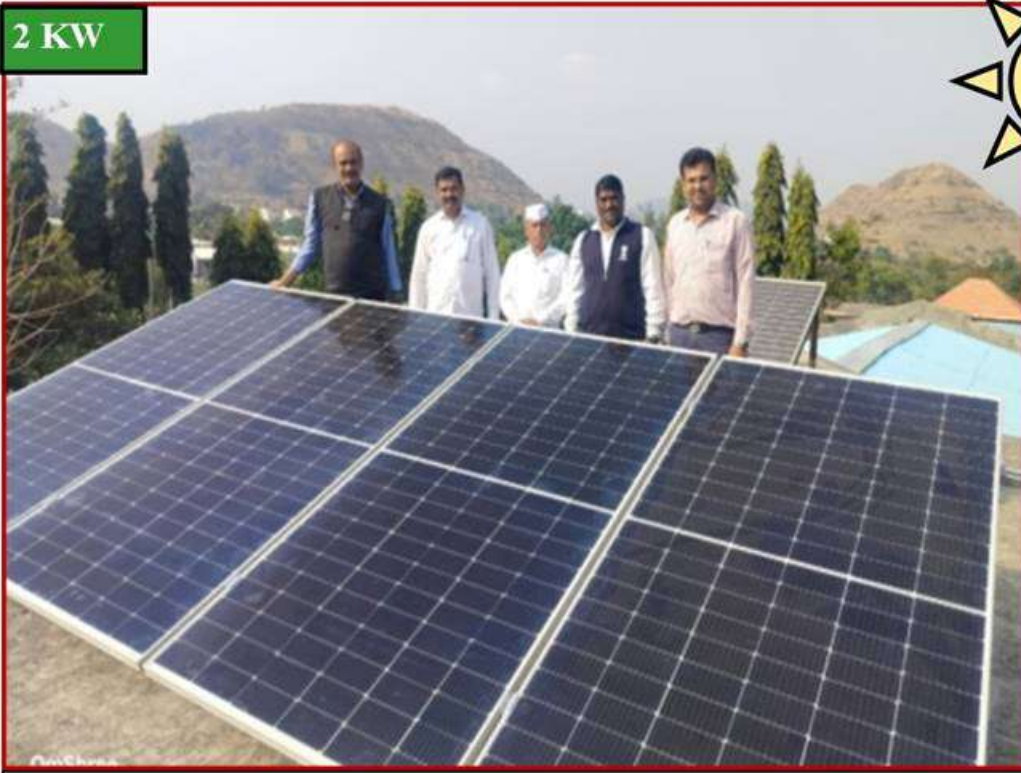
Z P School - Solar system at village Pingalwadi