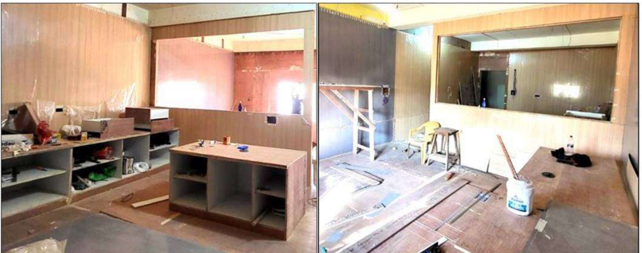
Ongoing work for Extension of CoE