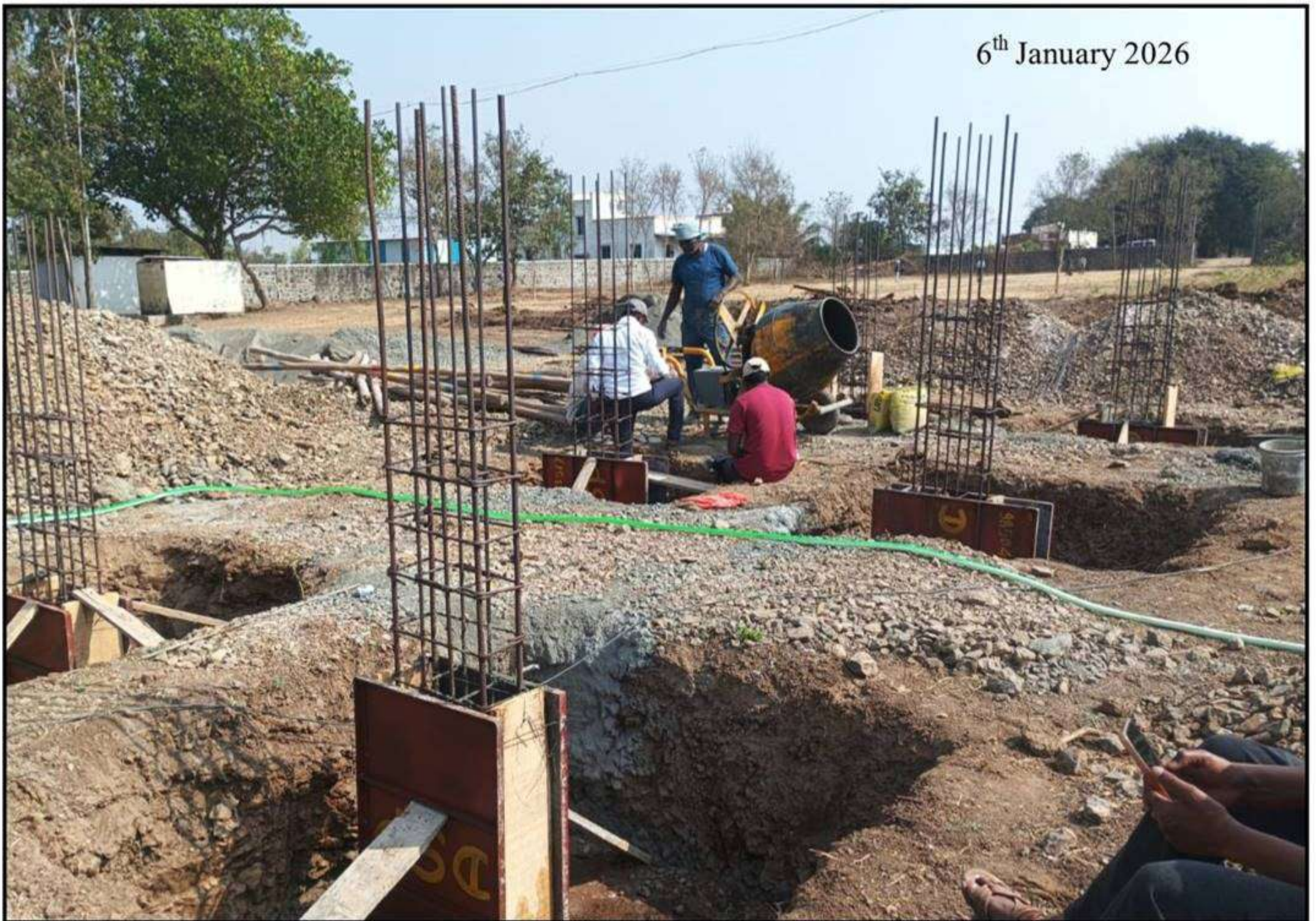
Construction of School building at Village Khatgun