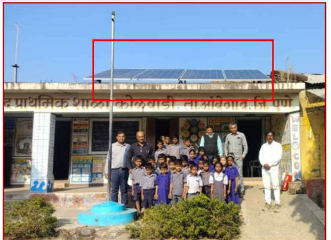
Z P School - Solar system at village Kolwadi