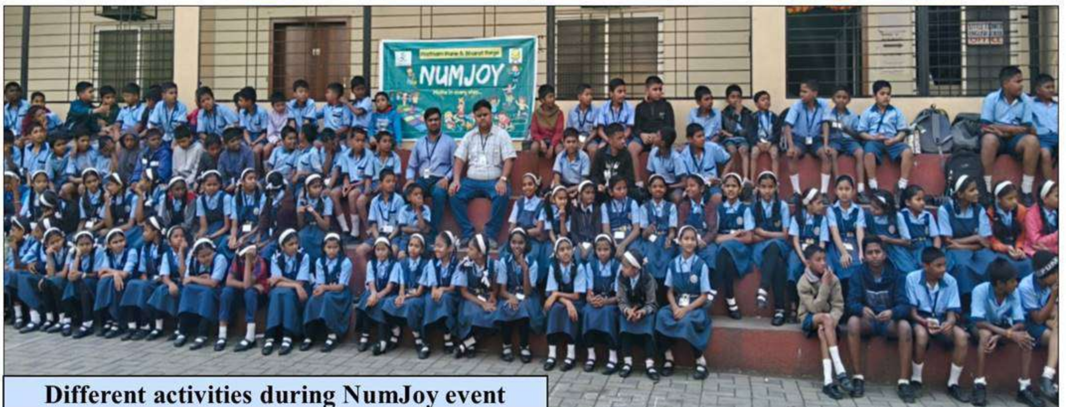
Different activities during NumJoy event