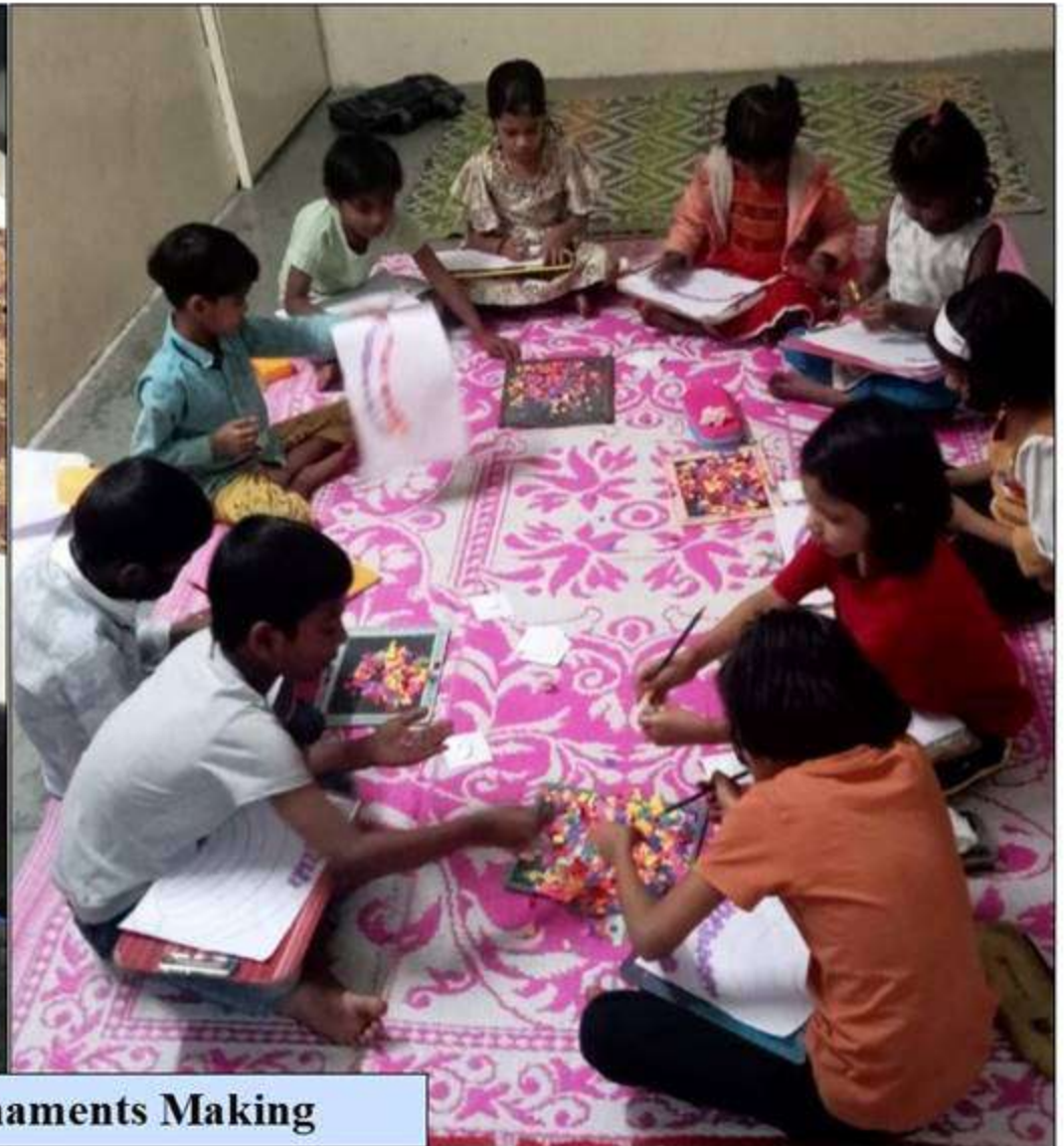
Creative Ornaments Making