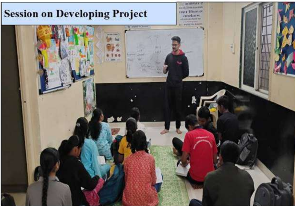
Session on Developing Project