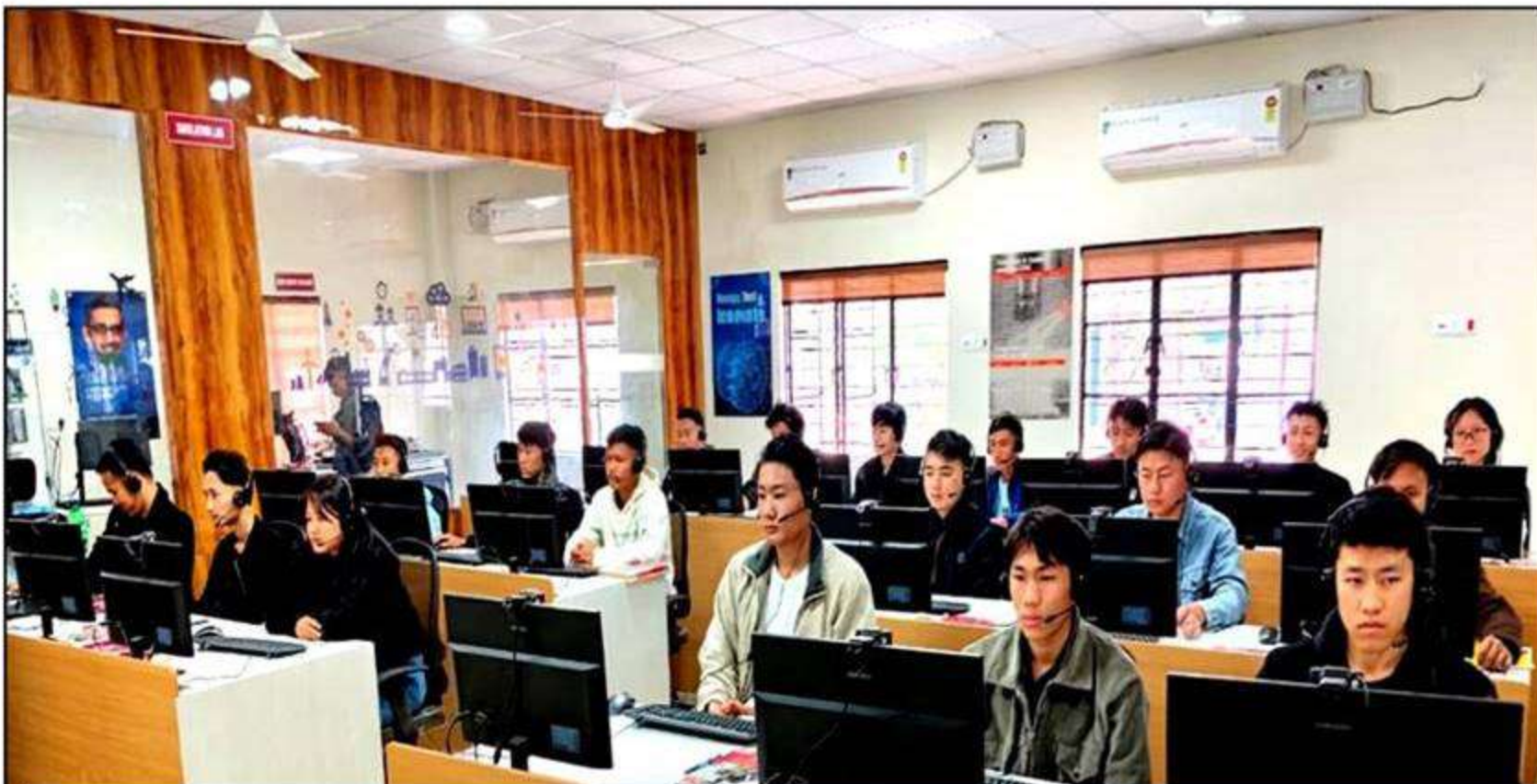
Students undergoing training for Jobs in Germany at CoE- Dimapur