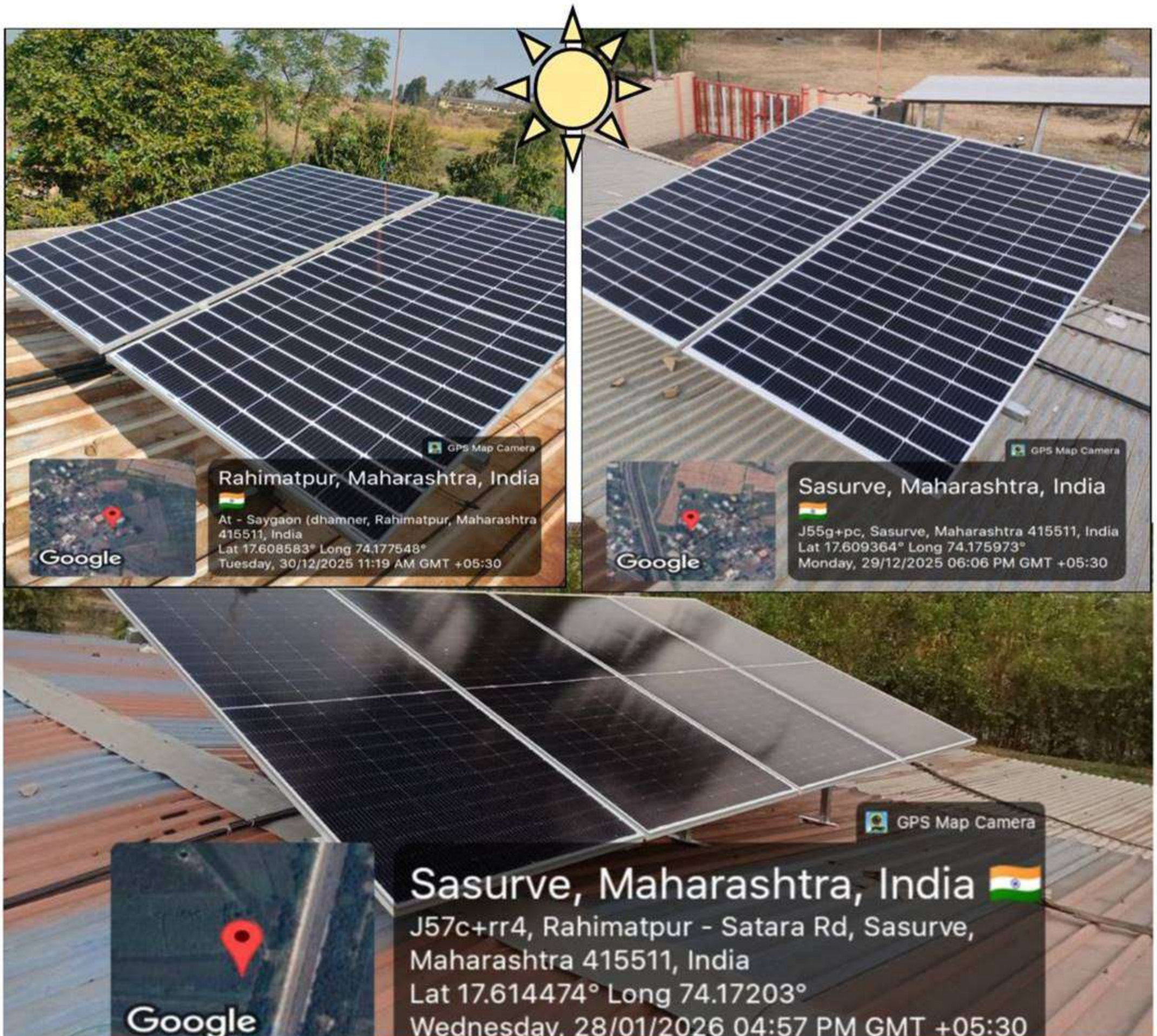
Solar systems at home in the village of Dhamner, Saygaon and Velang