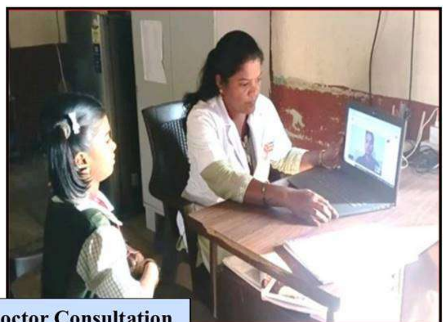
Tele call - Doctor Consultation