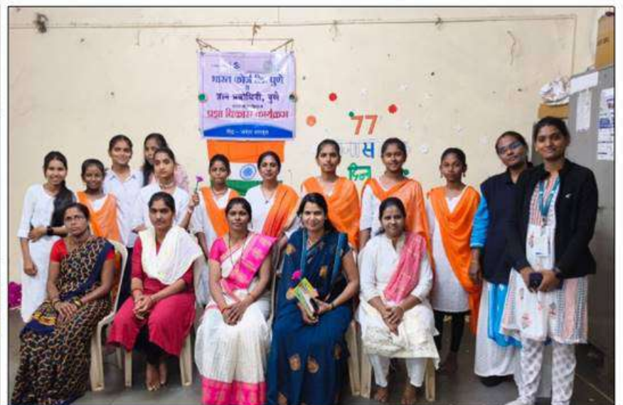
Culture Program & Prize Distribution