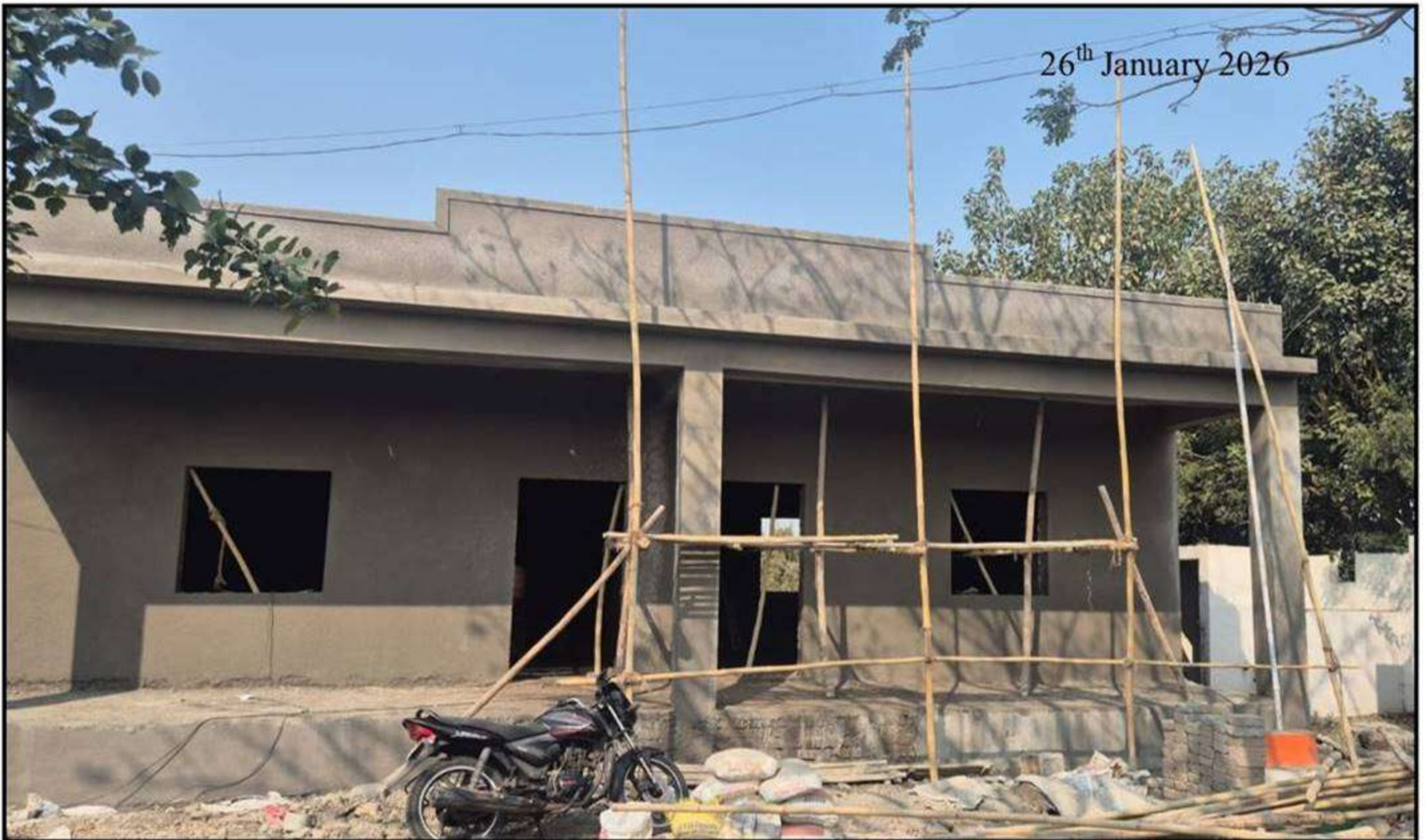
Construction of School building at Z P School Village Khalad