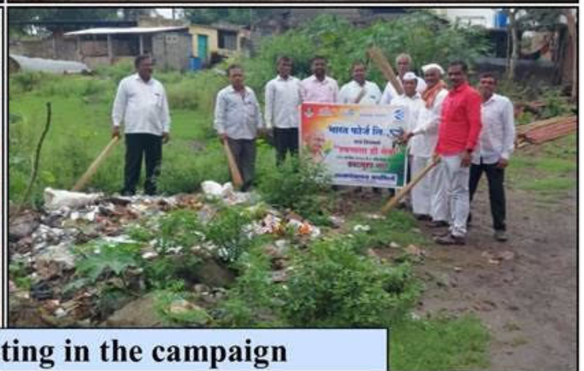
Villagers participating in the campaign