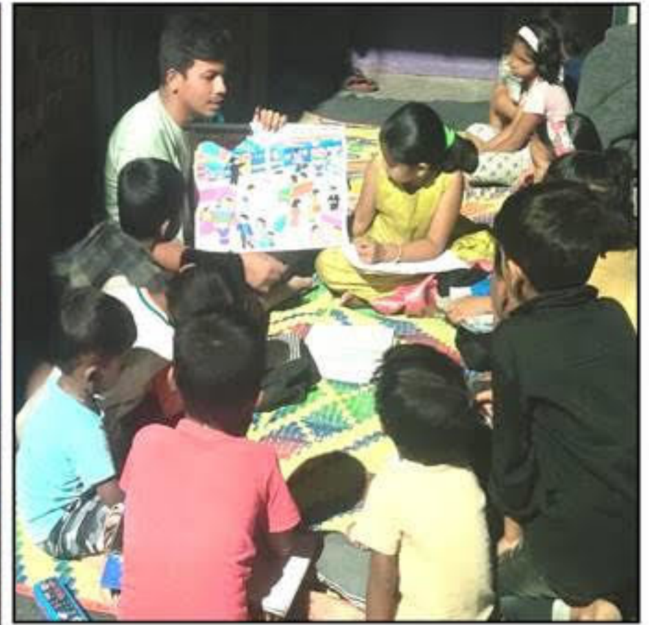
Activities of Balshikshan & Setushikshan