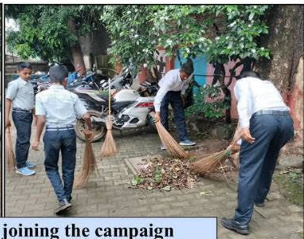
Employee Volunteers joining the campaign