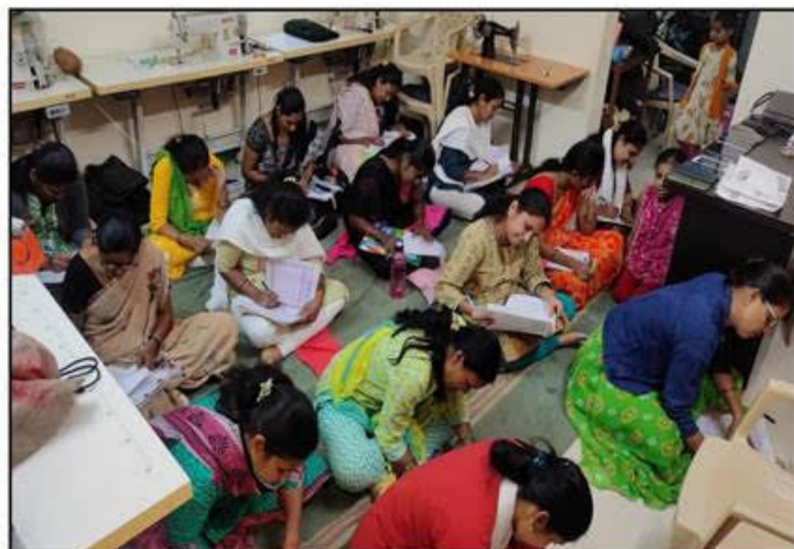
Community center Keshavnagar