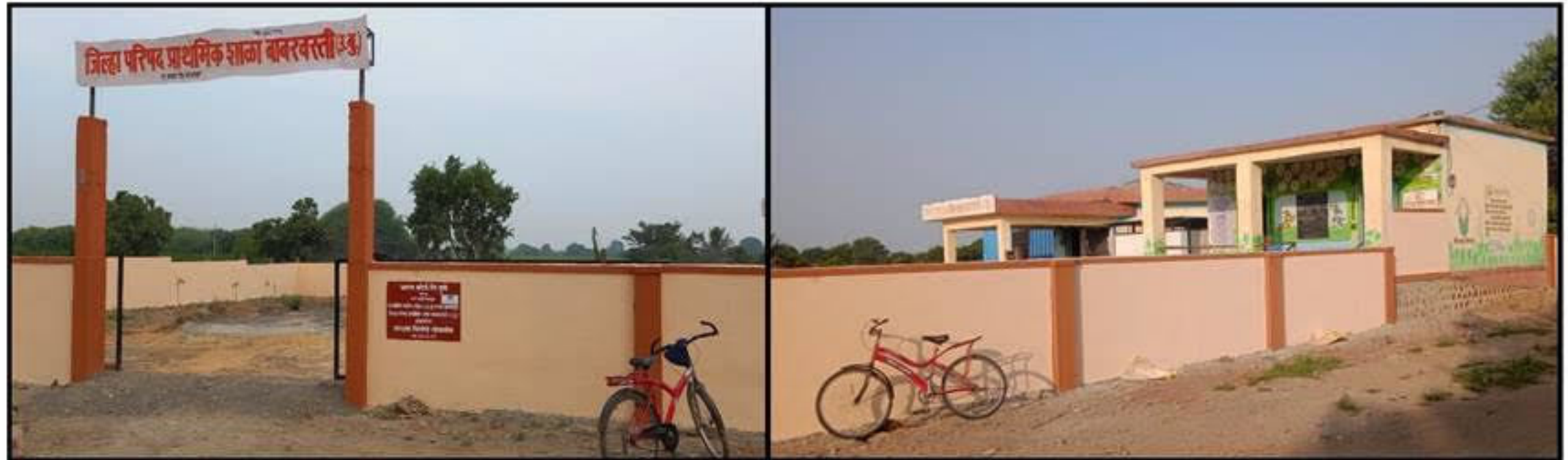
School compound wall