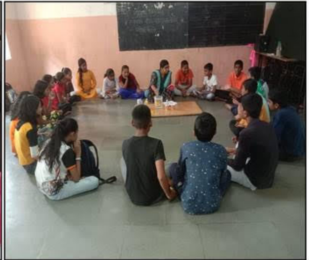
Learning through science experiments