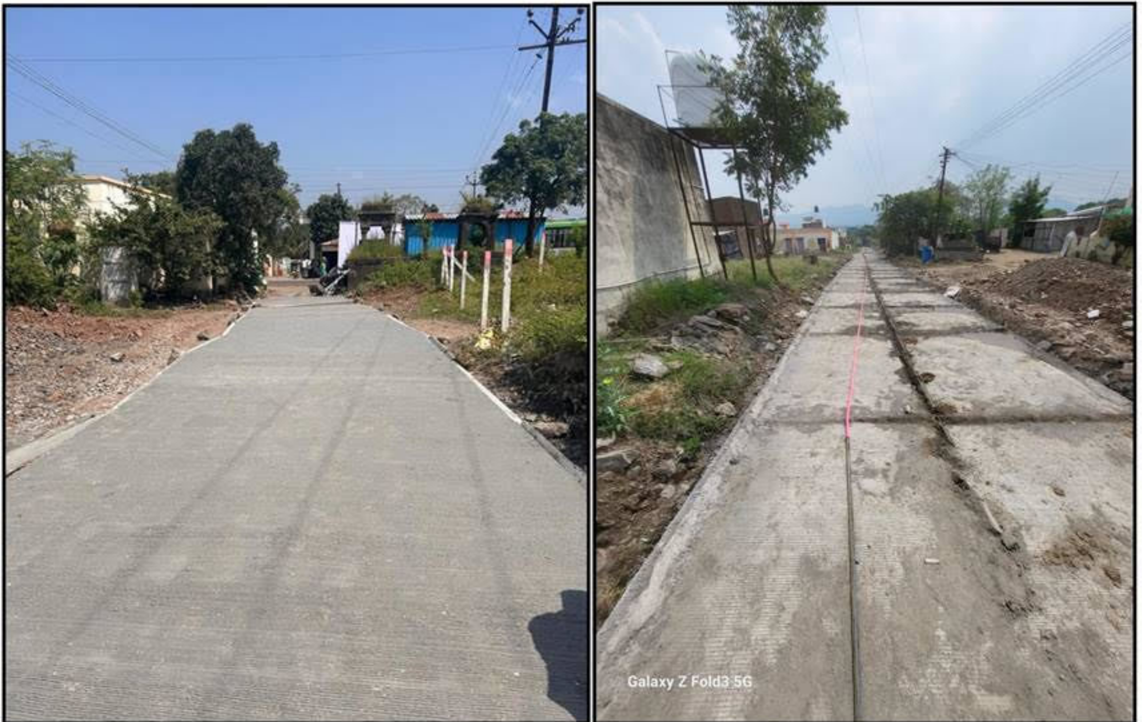
Construction of internal concrete & paver road at Bopgaon & Hivare