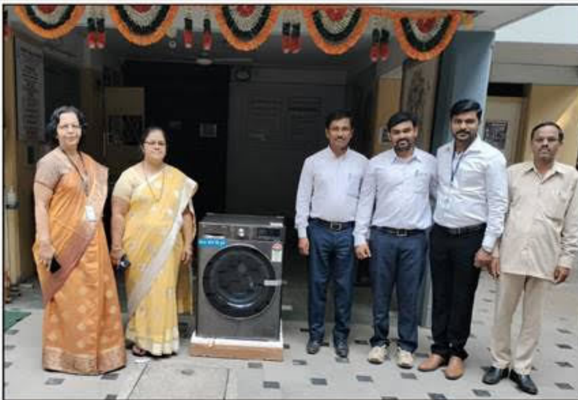
Bharatiya Samaj Seva Kendra