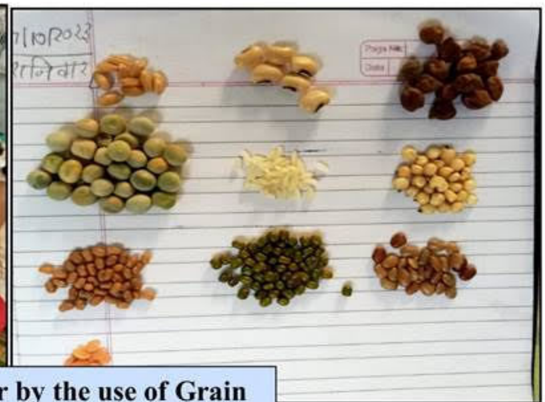
Counting Number by the use of Grain