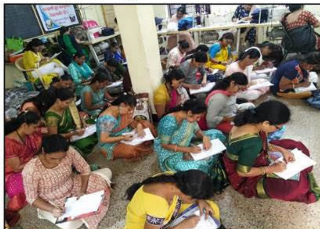
Community center Hadapsar