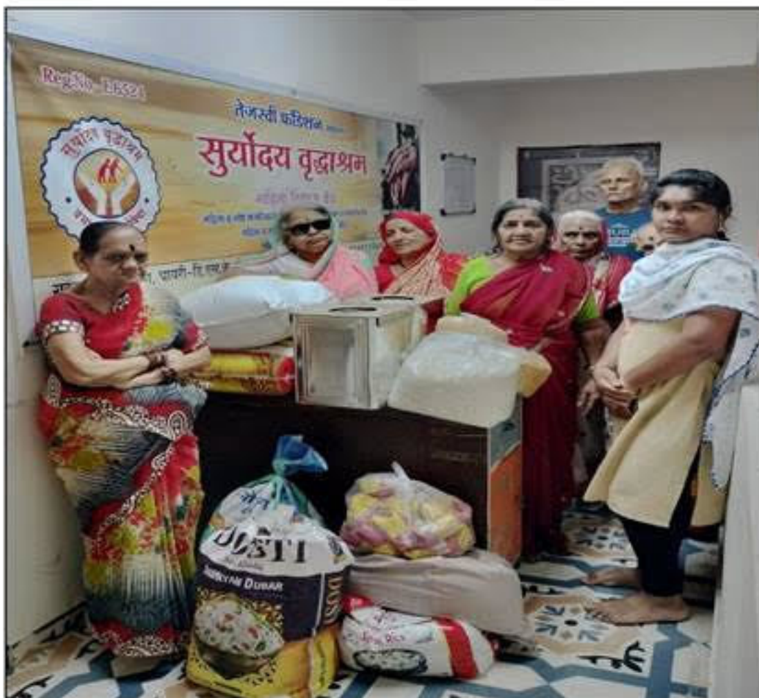
Suryoday Old Age Home