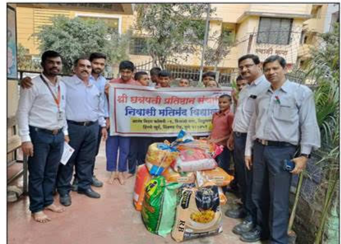
Nivasi Matimand Vidyalaya