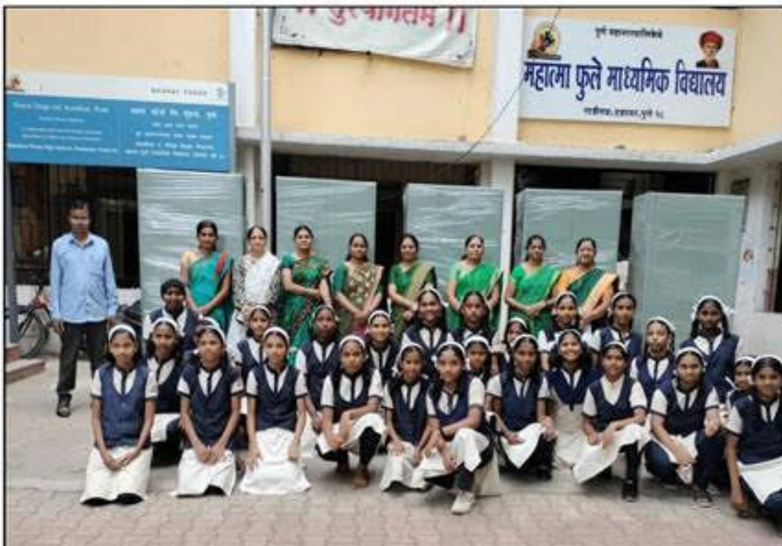
Mahatma Phule Madhyamik Vidyalaya