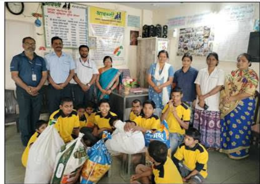
Shravasti Adhar Foundation