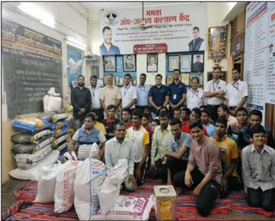
Mamata Andha Anath Kalyan Kendra