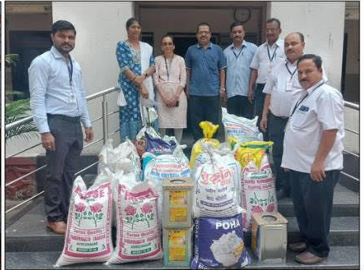
Shirdi Sai Baba home for aged blind women