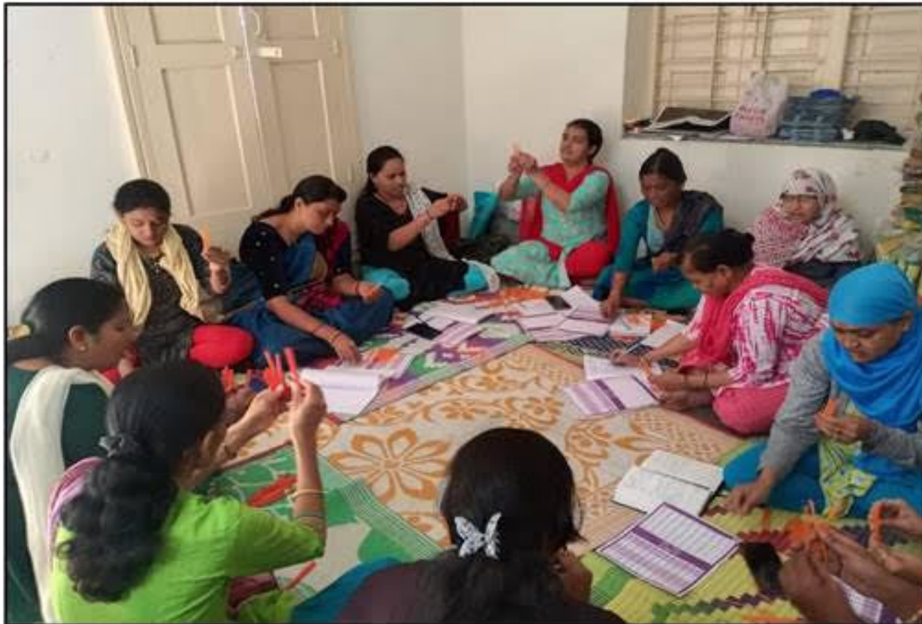
Training of Teachers