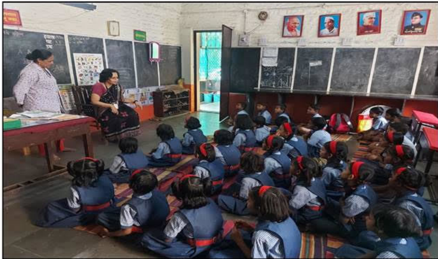
Interaction with School Children