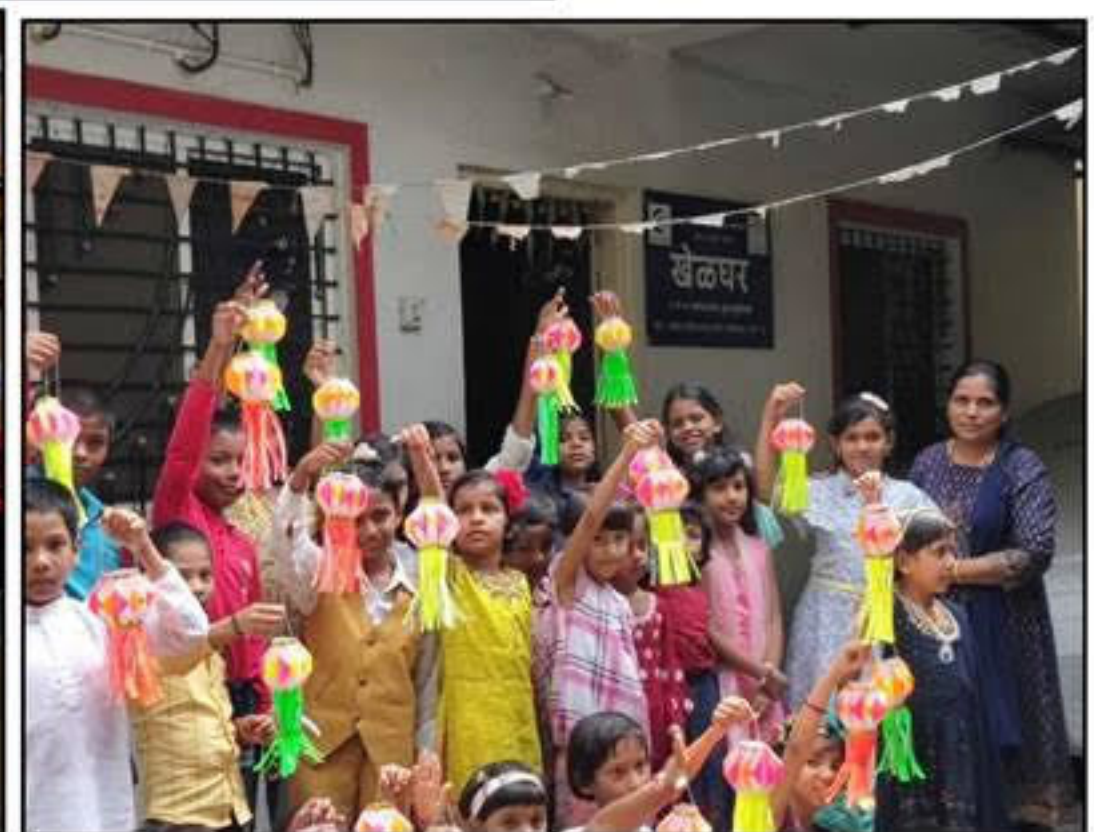
Craft making activity on the occasion of Diwali