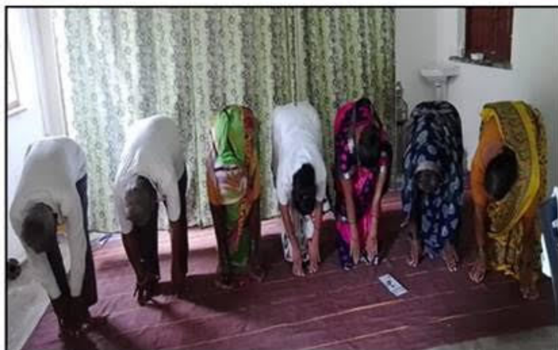
Physiotherapy session for the villagers