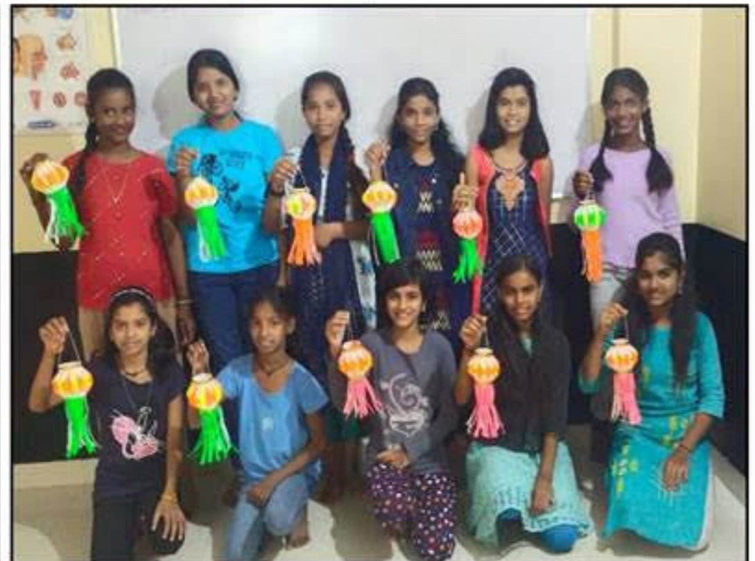
Craft making activities