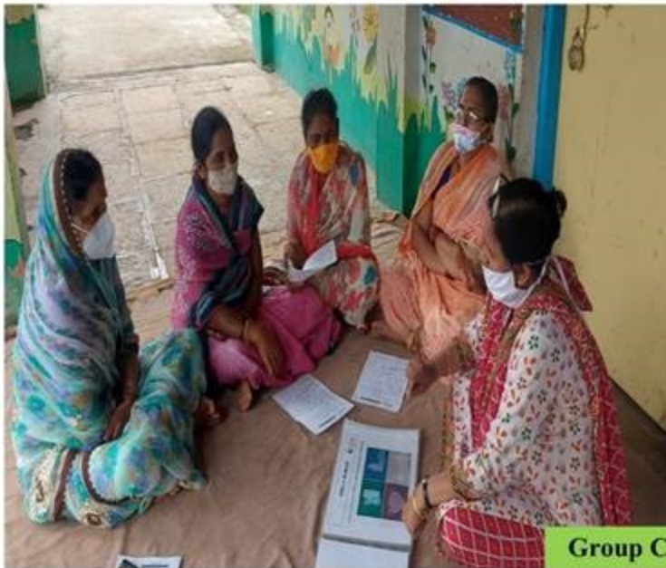
Group Counseling on Importance of the Checkup