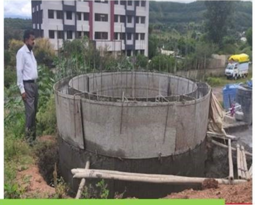
Construction of water tanks at village Vadgaon Kashimbeg & Kothamdara