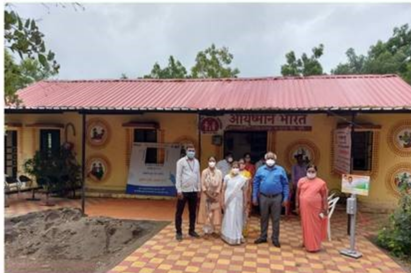
Roof work at Waghapur Primary Health Center