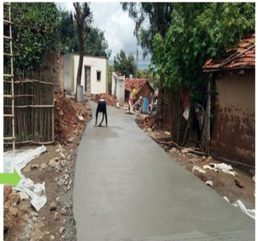
Construction of Internal road at village Vadgaon Kashimbeg