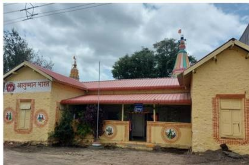
Roof work at Rajewadi & Singapore Primary Health Centre