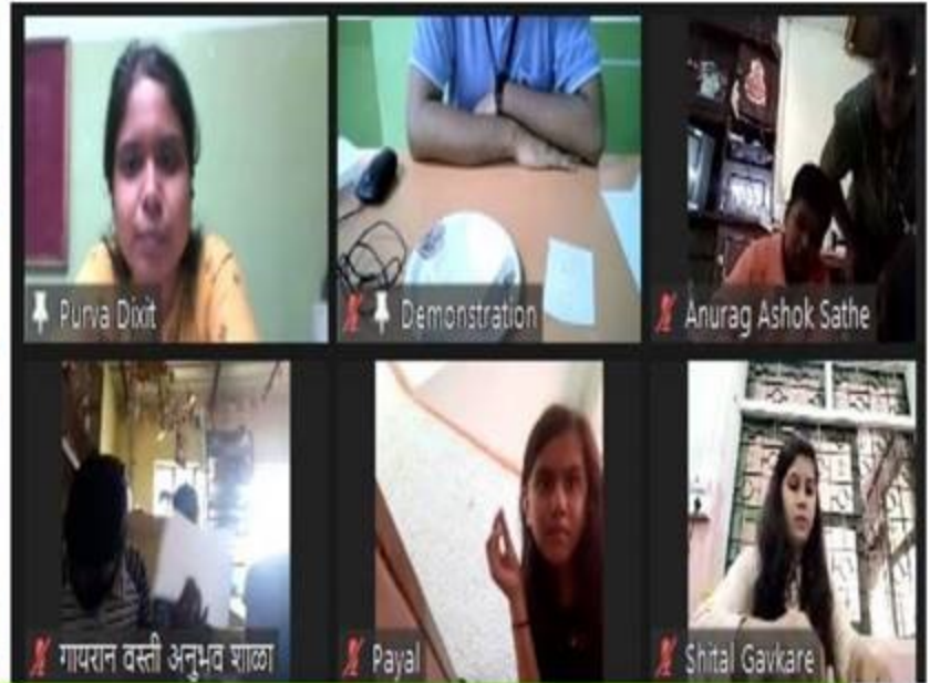
Online Science Practical Session for the children