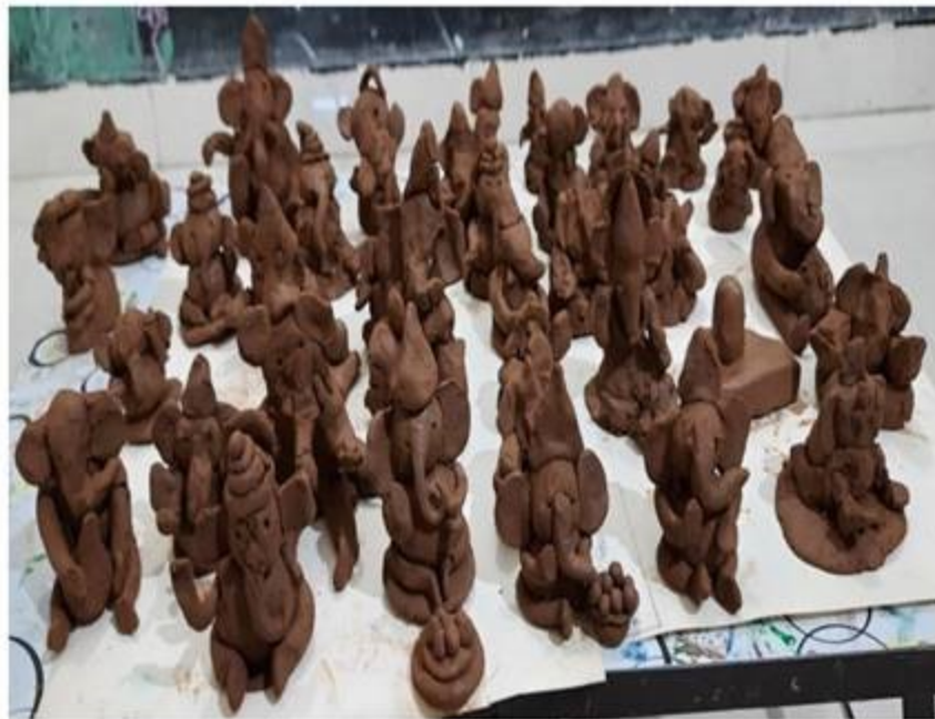
Ganesh Idol prepared by the children