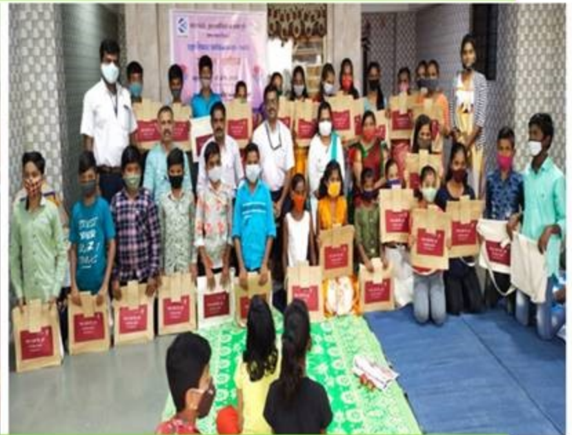
Distribution of study kit to the new batch of enrolled students