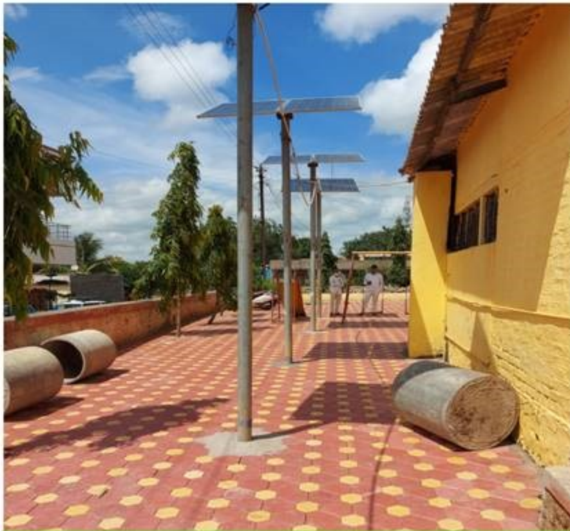
Pavers work at Malshiras Primary Health Center

The existing Primary Health Care Center of villages—Malshiras, Waghapur, Rajewadi, Singapore at Purandar Taluka were in bad condition, unclean and unhygienic. Considering this Infrastructure development work of the Primary Health Care Centers of these villages was done.