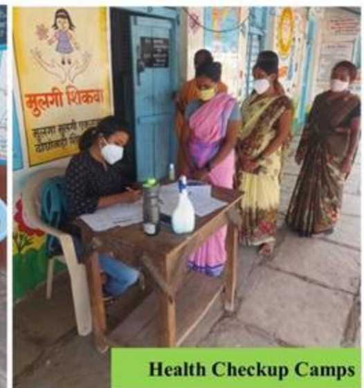
Health Checkup Camps