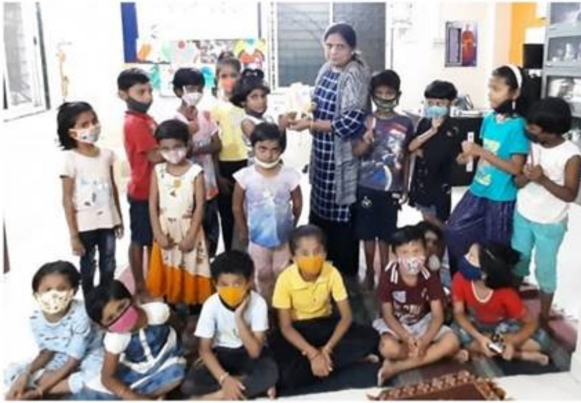
Celebrations Of Teacher Day in Anubhav Shala