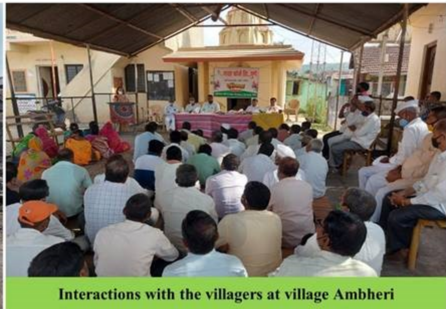
Interactions with the villagers at village Ambheri