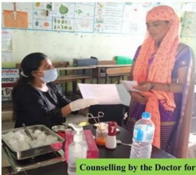
Counselling by the Doctor for further health checkup