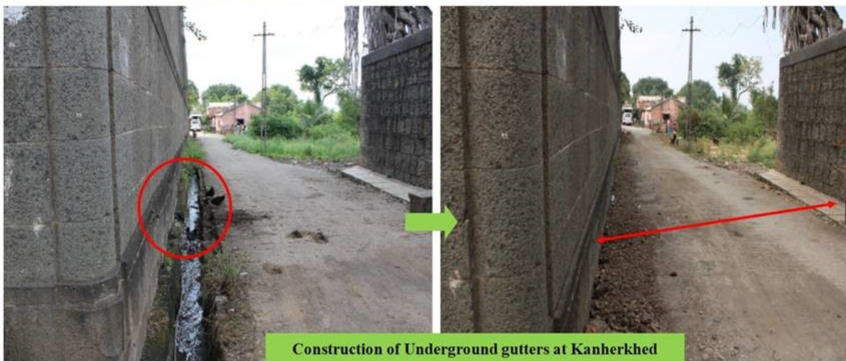
Construction of Underground gutters at Kanherkhed