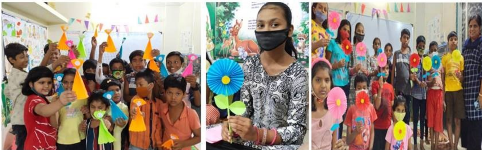
Craft Making Activities