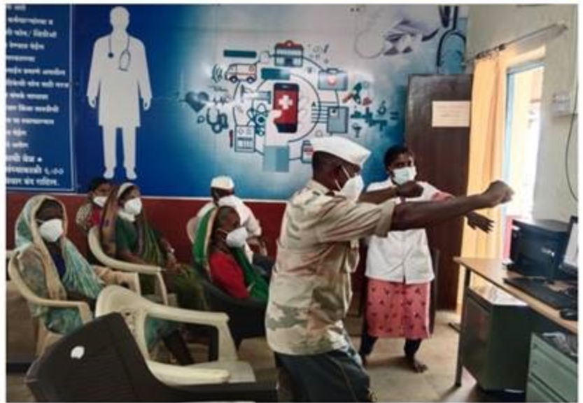
Awareness session on Health & Ortho exercise for the villagers