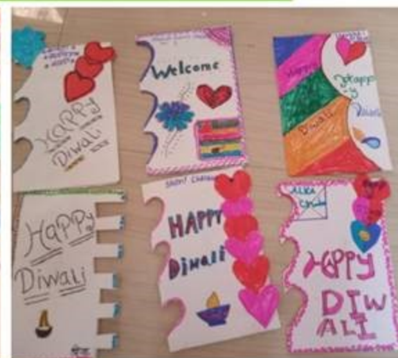
Panti & Greeting Card making activity