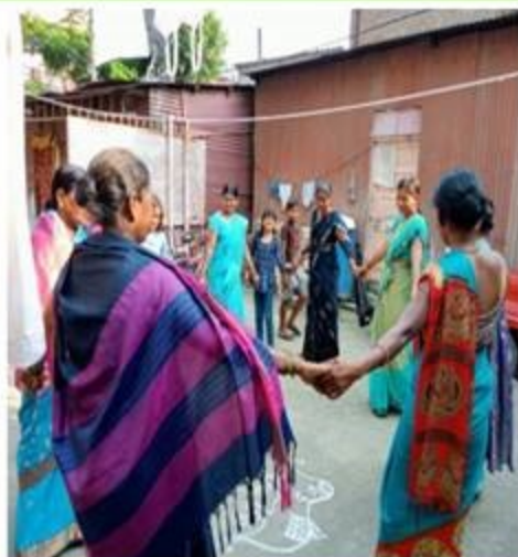
Bhandla festival celebrations