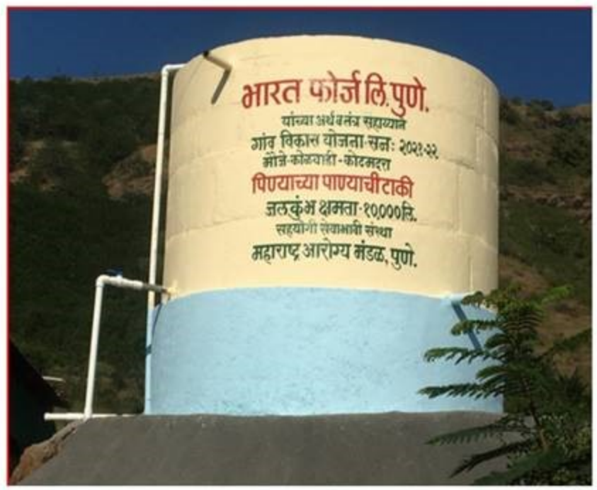
Construction of water tanks at village Vadgaon Kashimbeg & Kothamdara