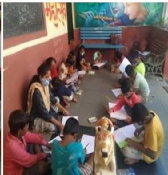
Language learning & worksheet solving activities