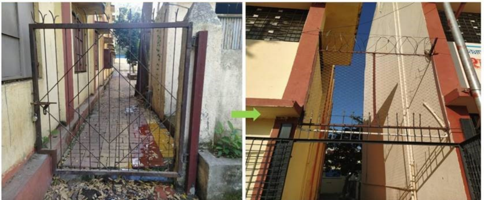
Repairing work at Vidyaniketan Shala No 4