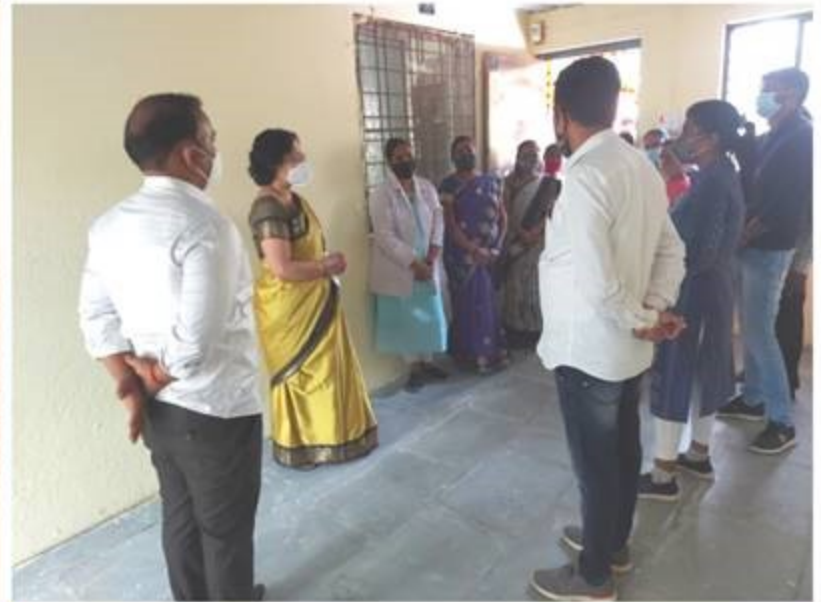
Constructed Vaccination room near Primary Health Center at village Vanpuri