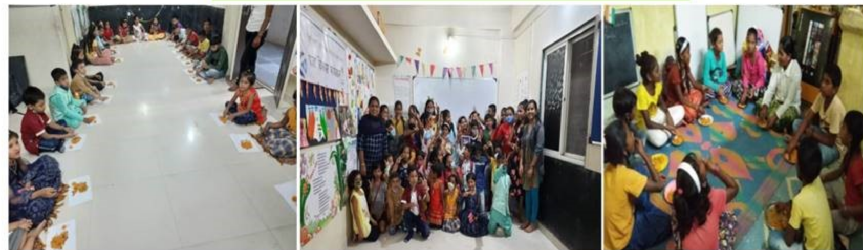
Distributions of Diwali Faral