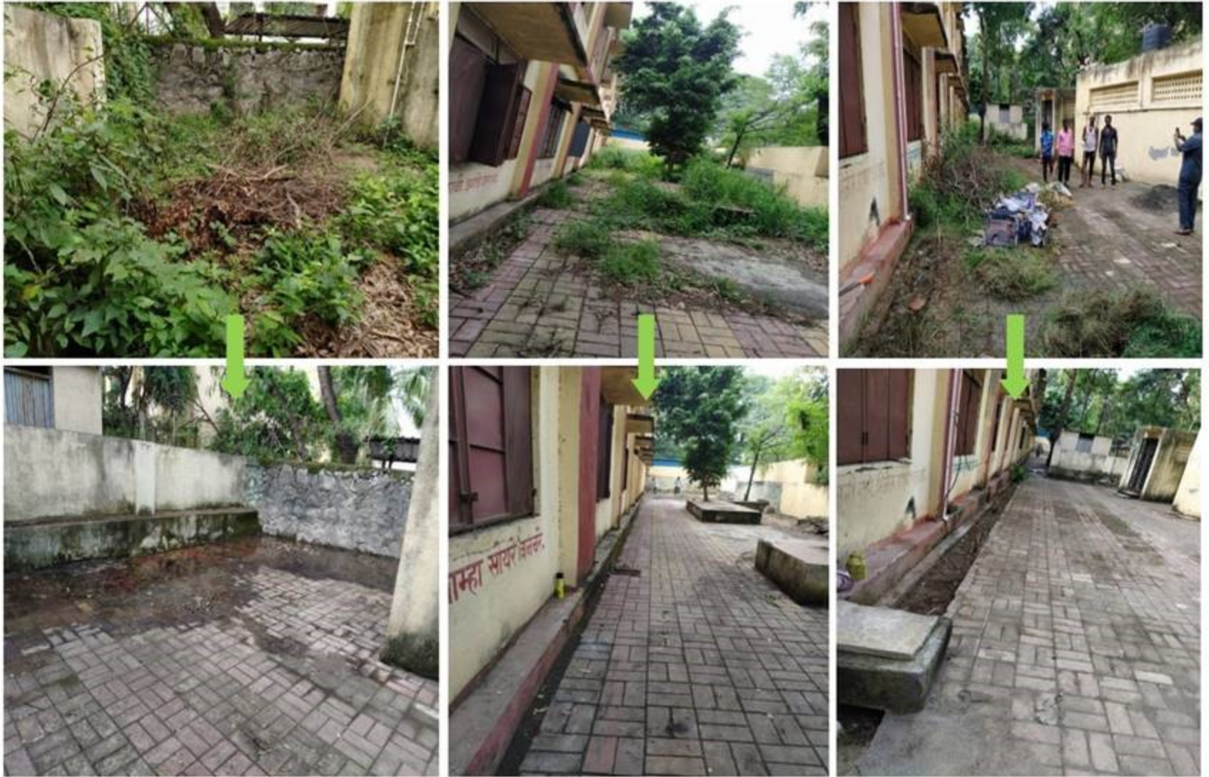
Cleaning and Repairing work of toilets of PMC School Vidyaniketan Shala No 4 Hadapsar Genital

After pandemic, before reopening of the school the total cleaning work was done by Bharat Forge Ltd. for - PMC Schools at Vidyaniketan Shala No. 4, Hadapsar, Gadital Pune. Cleaning and Repairing work of toilets of the schools was also done.