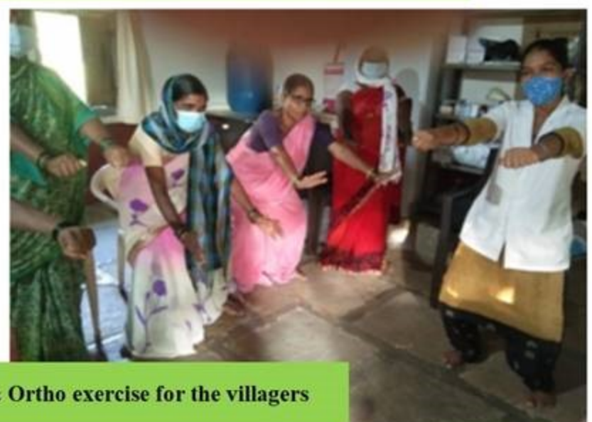
Awareness Session on health & Ortho exercise for the villagers