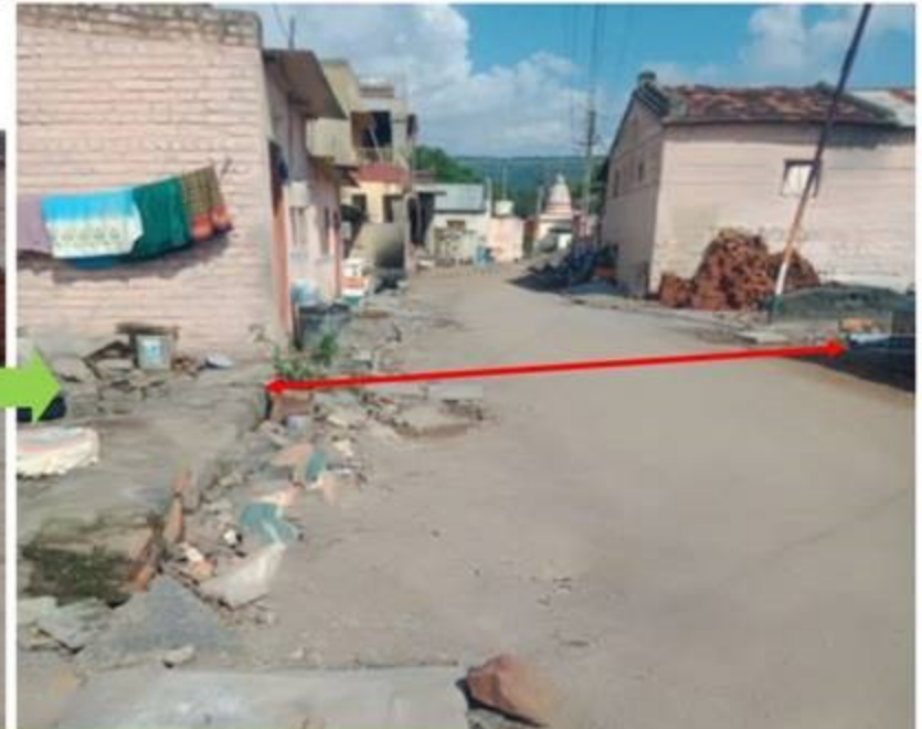
Construction of Underground gutters at Jaygaon