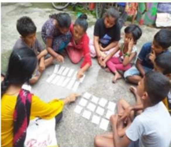
Preparing sentences activity