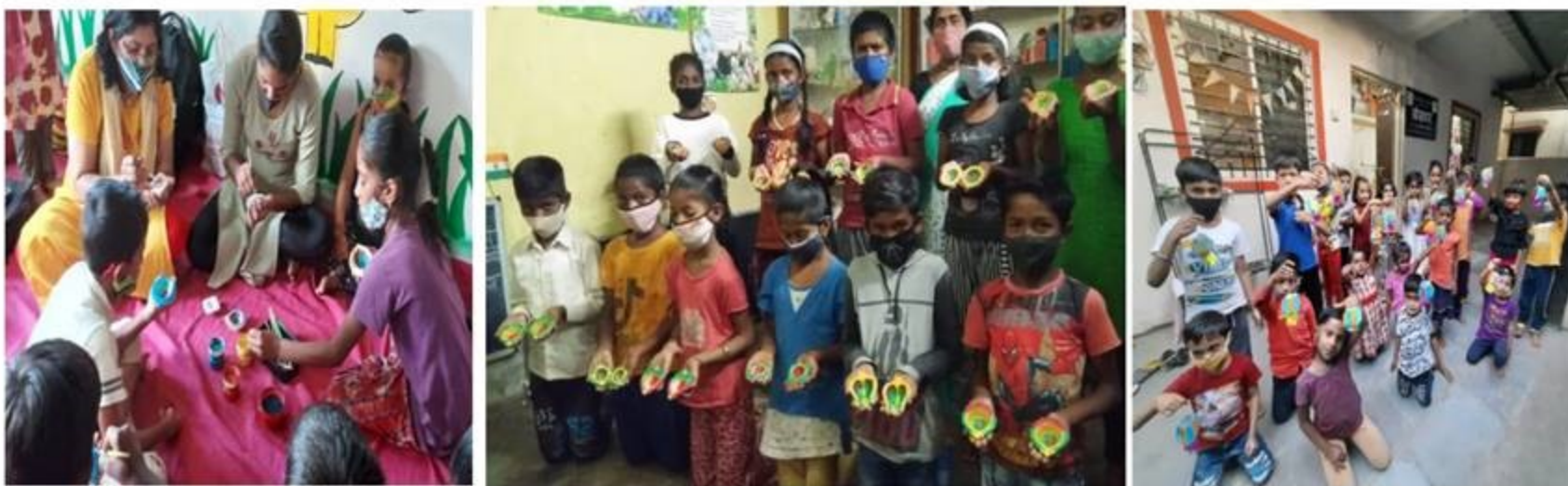
Panti & Aakshkandil Making Activities