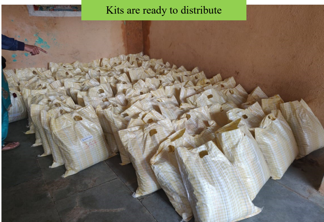
Kits are ready to distribute

We extend our thanks to all the employees for participating in this noble drive.