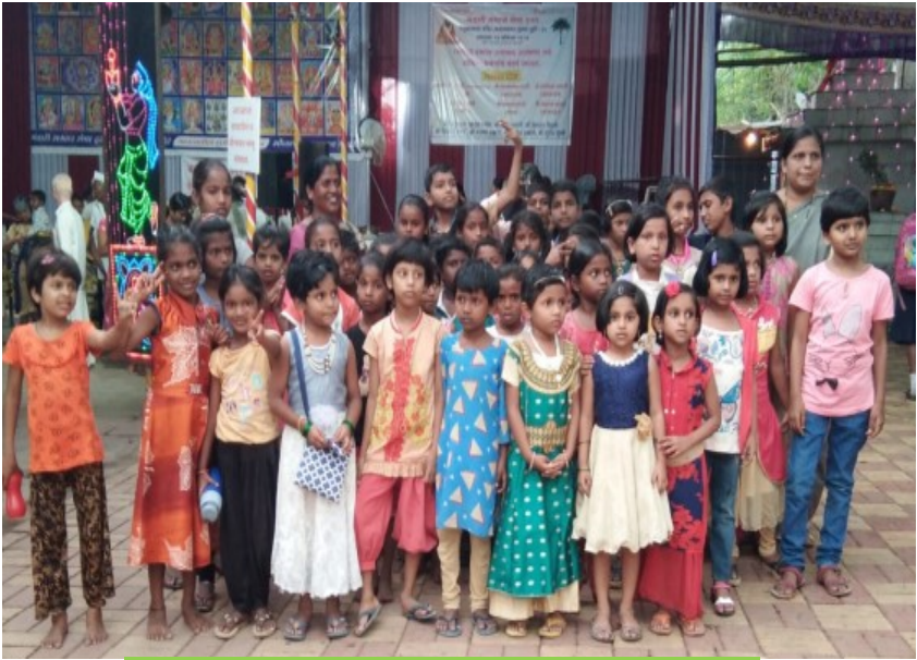
Study tour at Temple