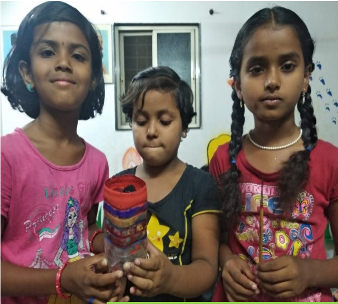
Best out of waste