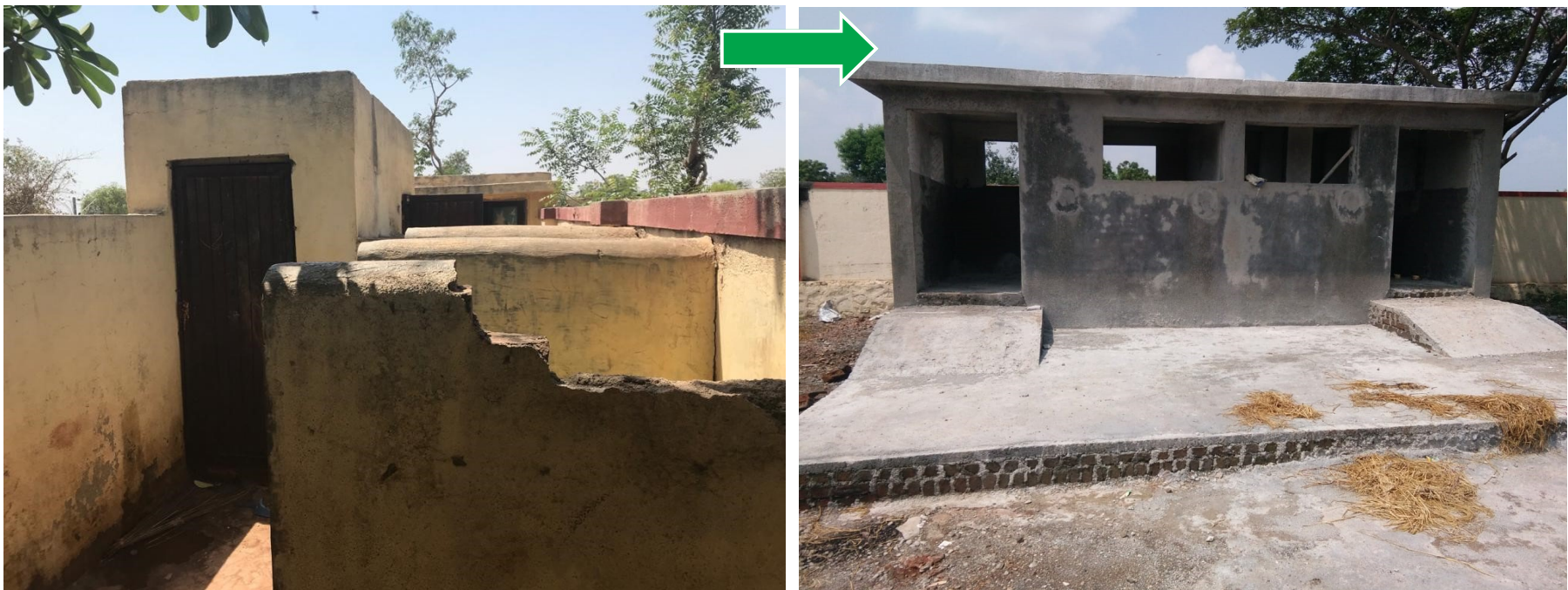
Toilet construction work in progress for Boys & Girls