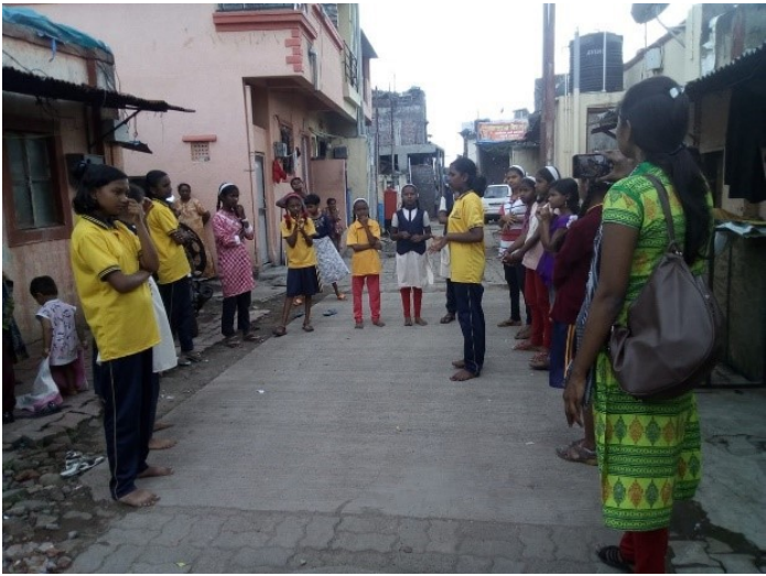
गांधी जयंतीच्या निमित्ताने पथनाट्य