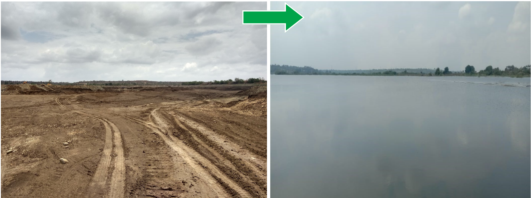
Madanwadi Talav is full of water today