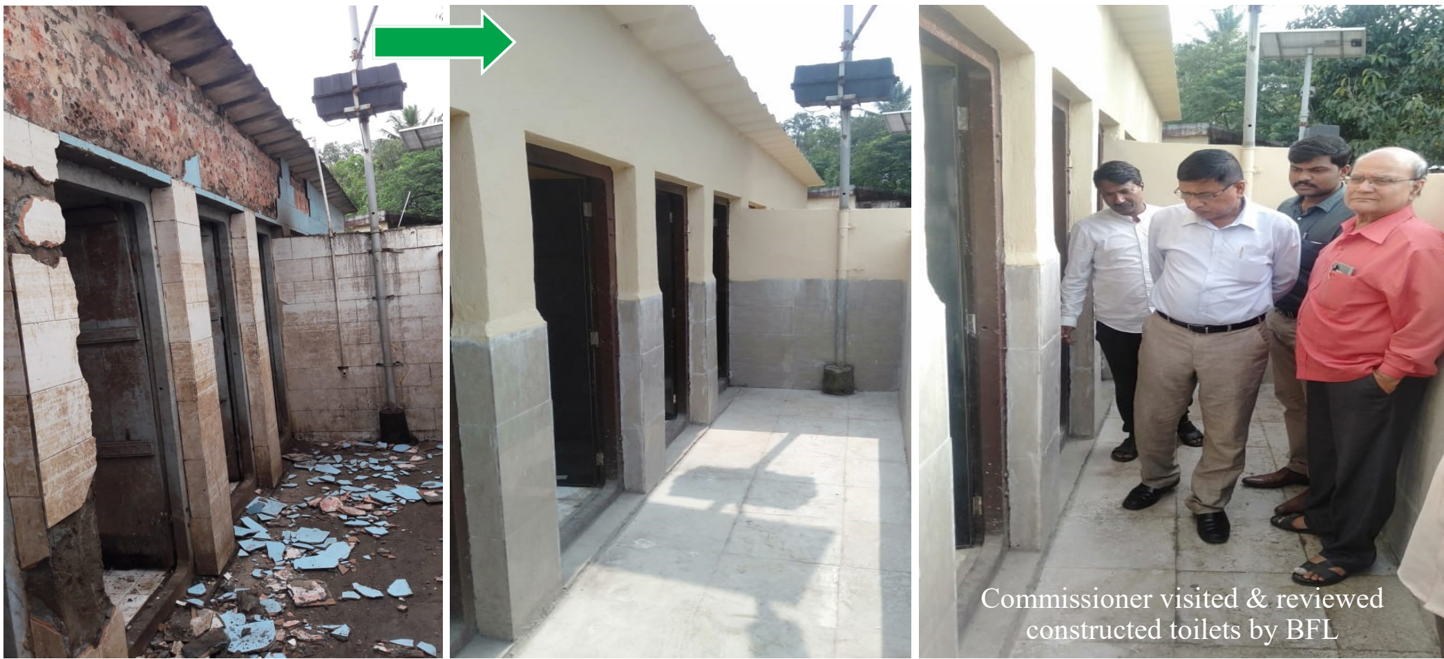
Commissioner visited & reviewed constructed toilets by BFL