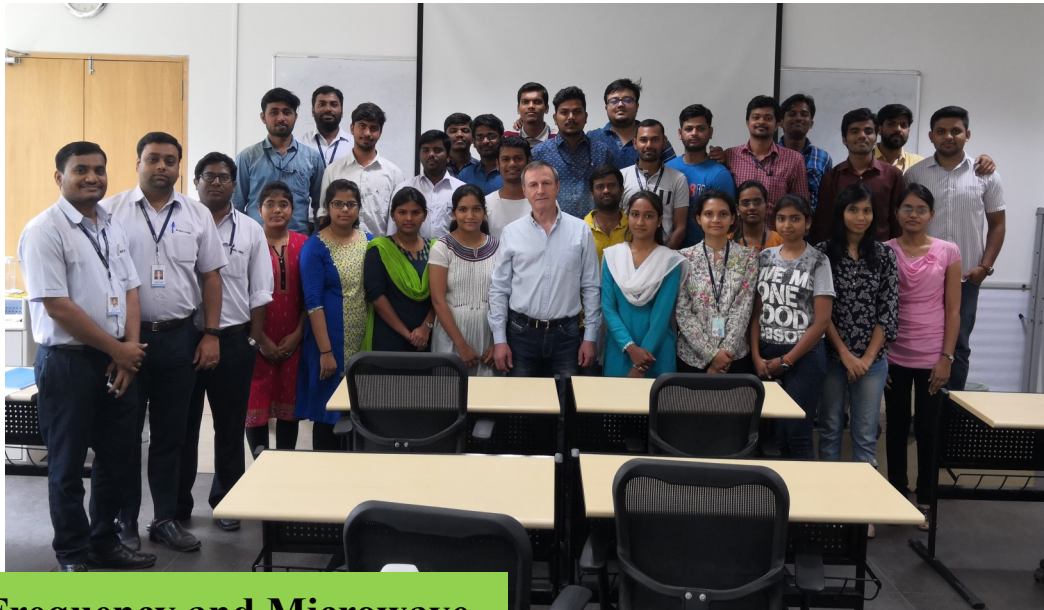
Advanced training program in Radio Frequency and Microwave