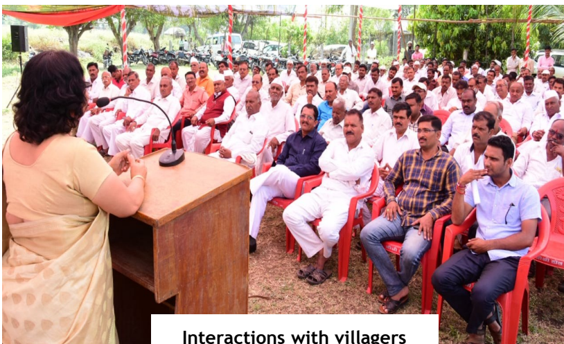
Interactions with villagers