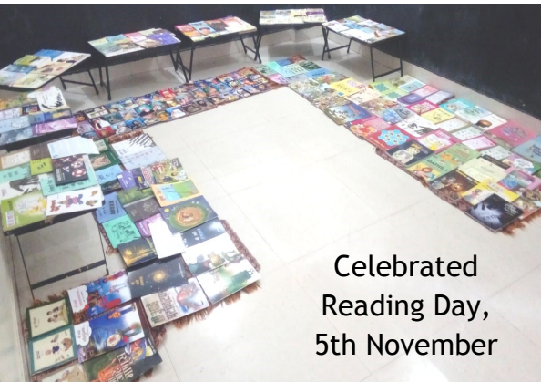
Celebrated Reading Day, 5th November