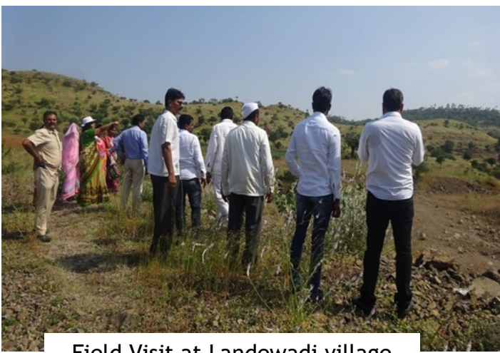
Field Visit at Landewadi village