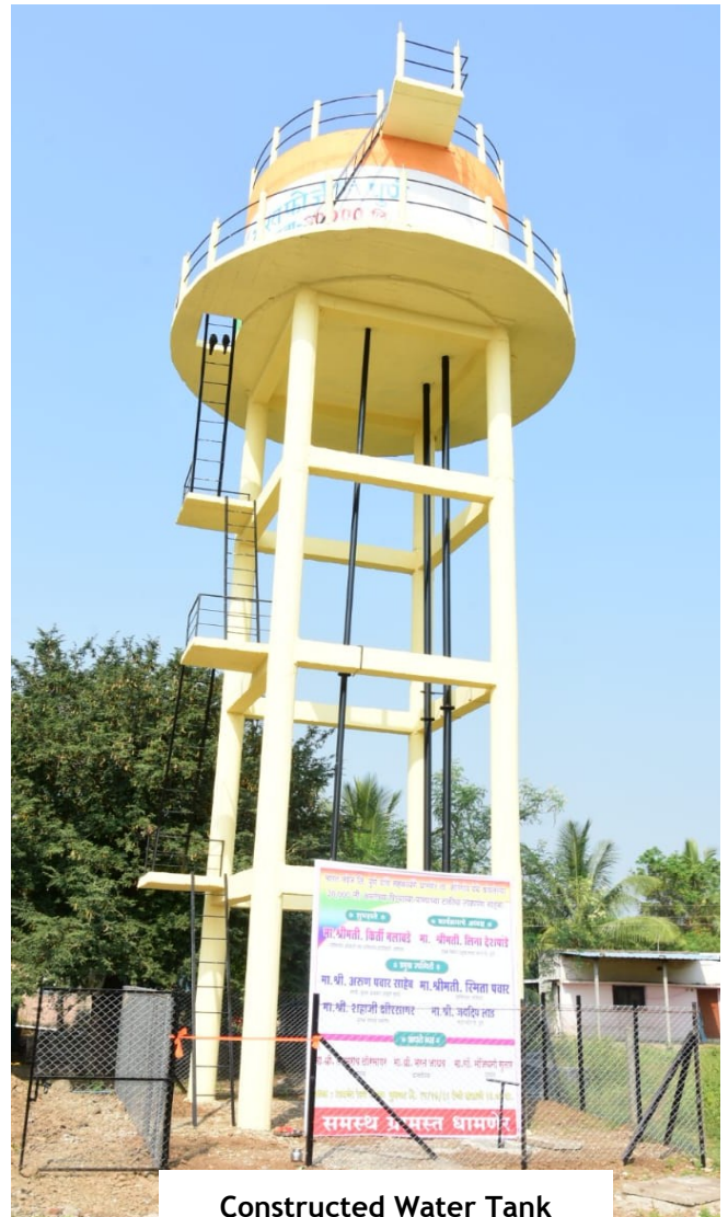
Constructed Water Tank