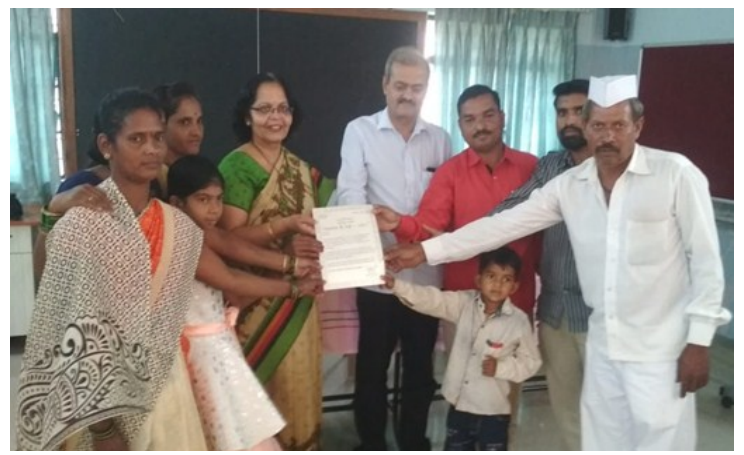
Certificate of Swachhata Hi Seva - 2018 given to 6 villages from Ambegaon taluka, Dist. Pune