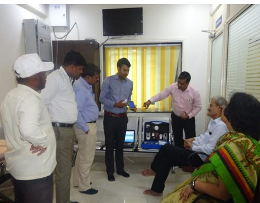
Meeting regarding Medical kit for villagers under Health indicator