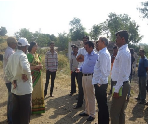
Nighotwadi - Dasturwadi Village & School visit