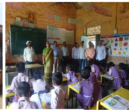
Kashimbe [Budruk] School visit