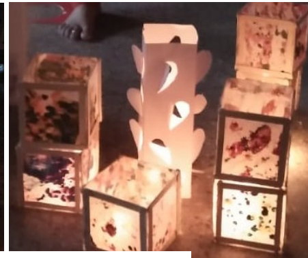
Creative lamps for Diwali