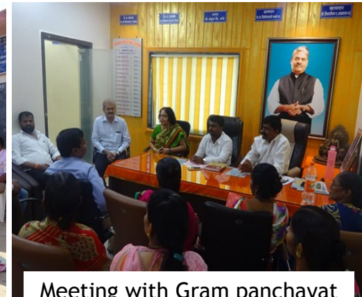
Meeting with Gram panchayat at Landewadi village