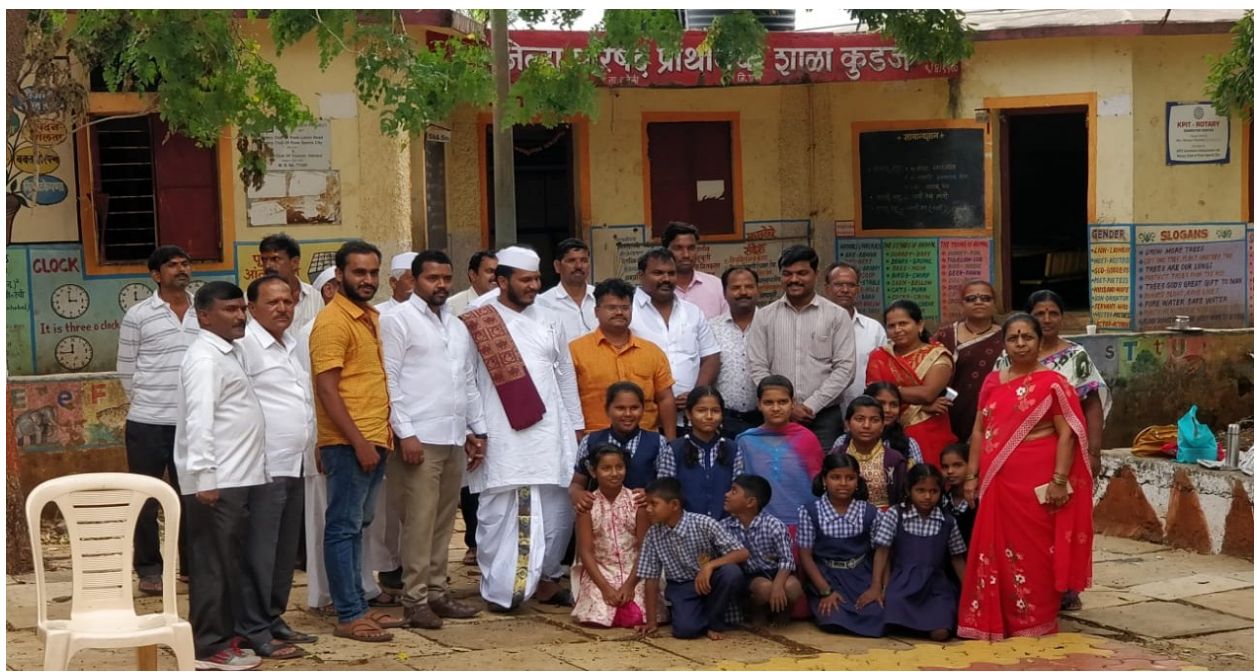
Work is in progress