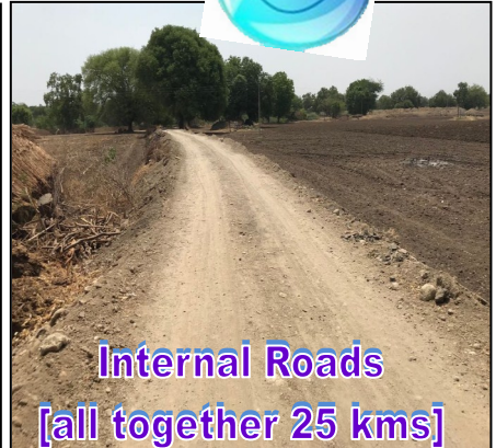
Internal Roads [all together 25 kms]