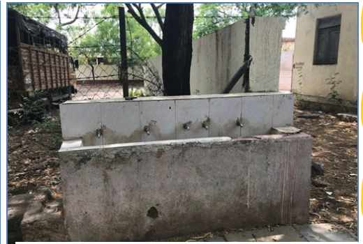
Present condition of Drinking Water in the school