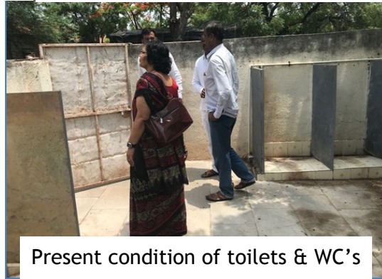
Present condition of toilets & WC's