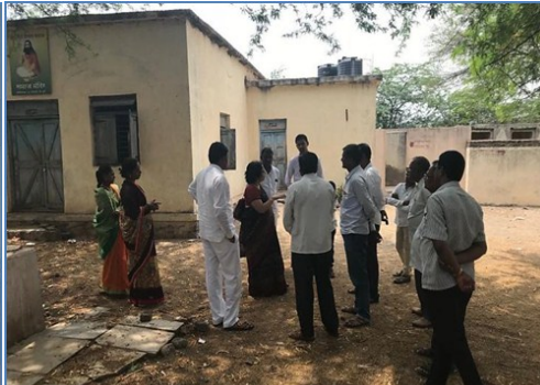
Interaction with Villagers