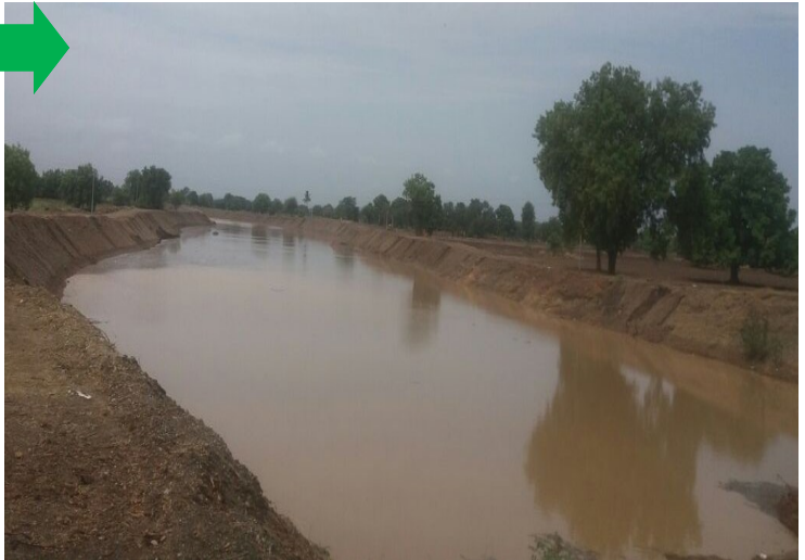
Desilting of river Nani in Aakhegaon