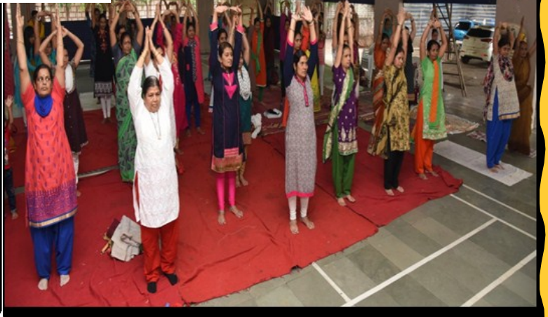
AT MAHATMA PHULE SCHOOL-HADAPSAR