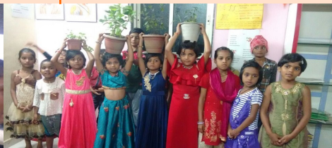
On Ashadi Ekadashi - Palakhi Sohala Conducted with students