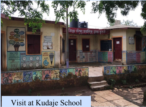
Visit at Kudaje School