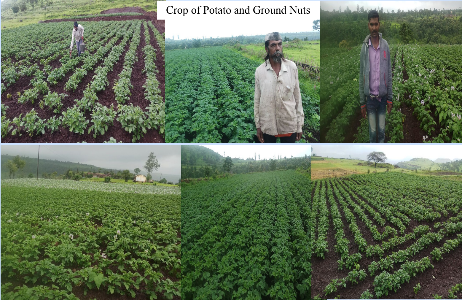
Crop of Potato and Ground Nuts

About 3 months ago, we had done land levelling of the lands of few villagers from Thakarwadi and Kotamdara villages from Ambegaon Taluka. The silt that was taken out in desilting work was spread out on these lands. In this rainy season, these villagers could grow potatoes and ground nuts. The villagers are from extremely poor strata and generations together have been working as laborers. For the first time in their life they could do farming in their own land. Their income level will increase multifold....beyond their imagination. This has become very successful experiment.