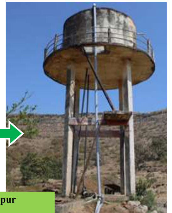
Water Pipeline work completed at Visapur