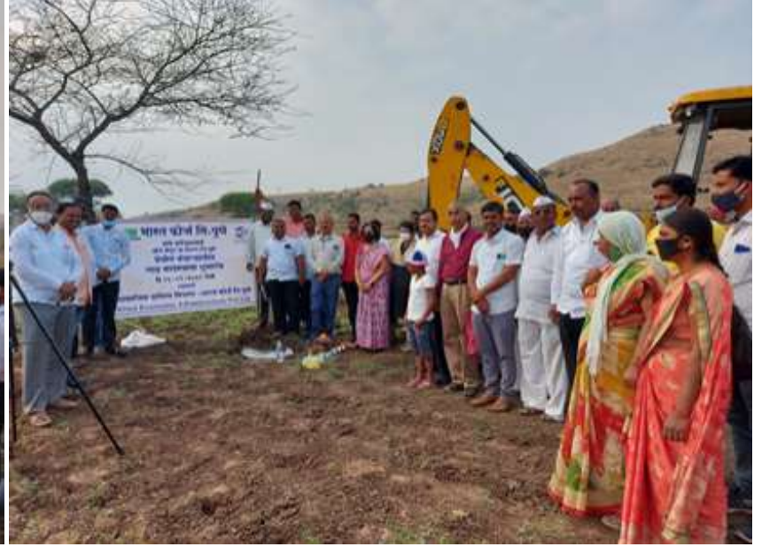
Interaction with villagers at Kendoor