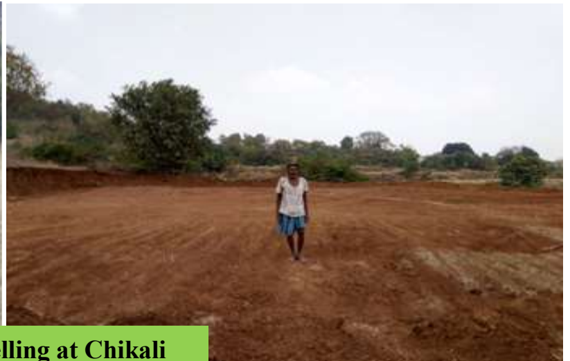
Land levelling at Chikali