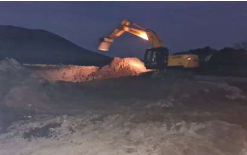
Work in progress- Desilting of 2 Bandhara sites