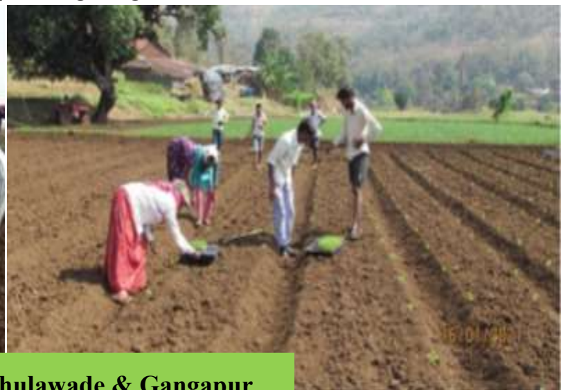
Organic Farming at Phulawade & Gangapur