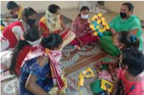
Craft Activities for Children