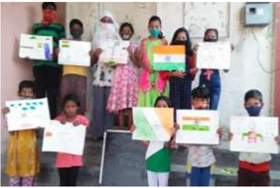
Virtual Celebration at Annabhau Sathe Na-