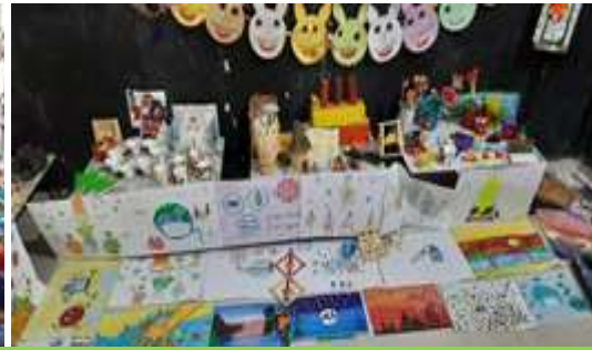
Presentation of Activities by Children