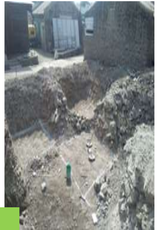
Construction of water tanks in progress