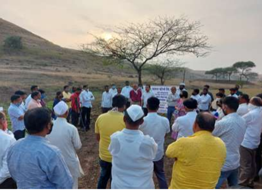
Inauguration of Bandhara desilting at Kendoor

Bharat Forge will start the desilting work of 2 Bandharas at Kendoor. This will help to recharge all the wells and bore wells and will benefit more than 7000 farmers to irrigate their land and have access to water throughout the year.