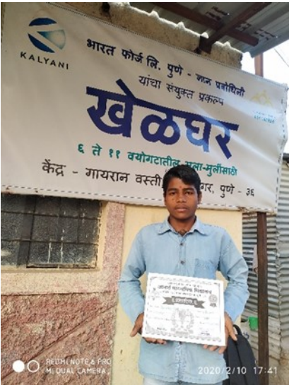
1st in Handwriting Competition conducted by School.