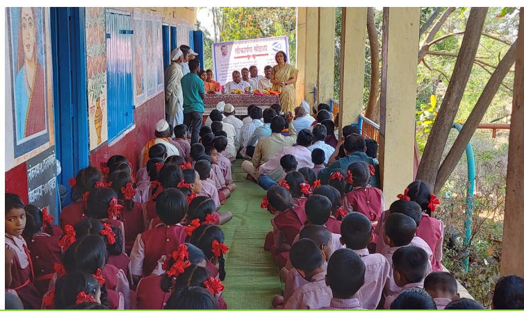
Interactions with villagers & students at Varewadi