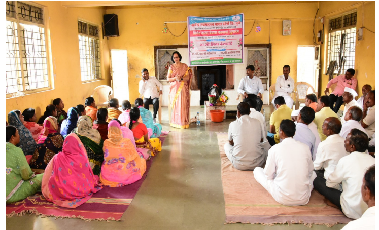
Interactions with villagers