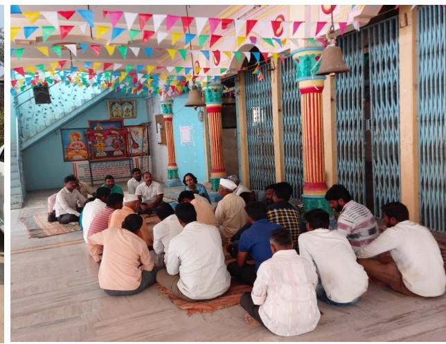
Site visit & Interactions with villagers at Khalad, Ambodi, Singapur & Vaghapur