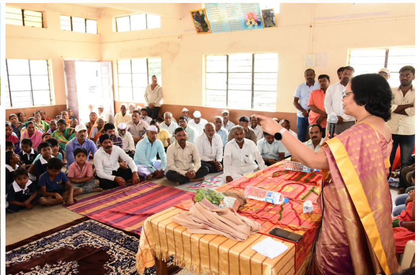
Interactions with villagers