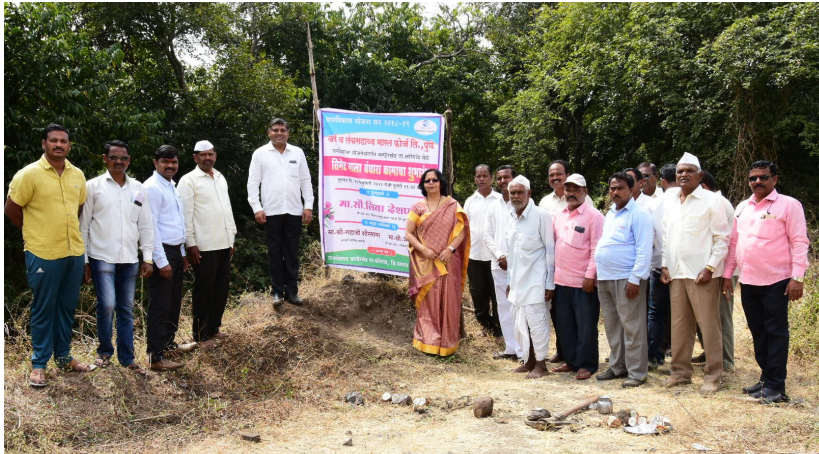
Inauguration of Construction of bandhara work site at Kanherkhed