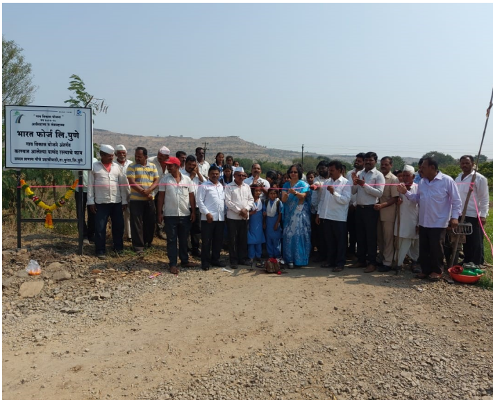
WBM Road at Udachiwadi