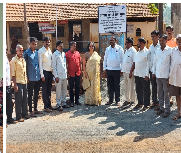
Interactions with villagers at Vicharewadi