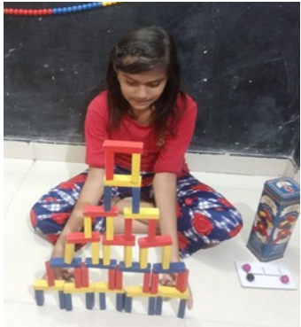
Tovar making activity