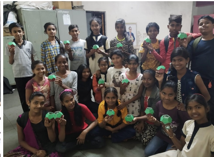
Making Pen stand