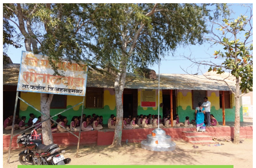
Interactions with School staff at ZP school