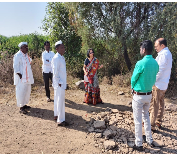
Interactions with Villagers

Visited village Sonalwadi & Bhutwada to review the current situation for proposed projects