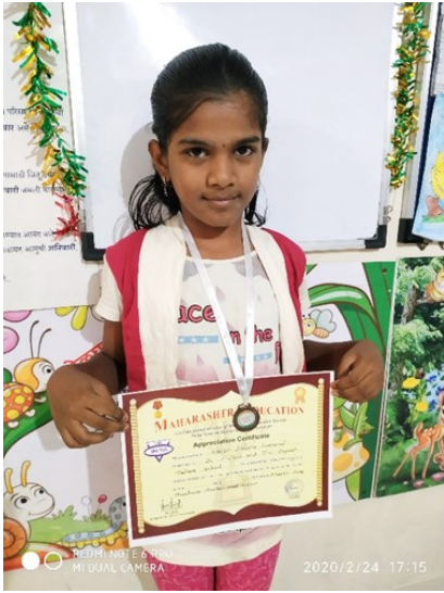
1st in quick in Mathematics Competition conducted by Maharashtra Tilak Vidhyapith