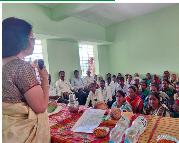
Interactions with villagers at Lavhatewadi