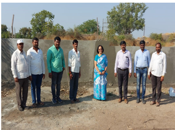
Work is in progress