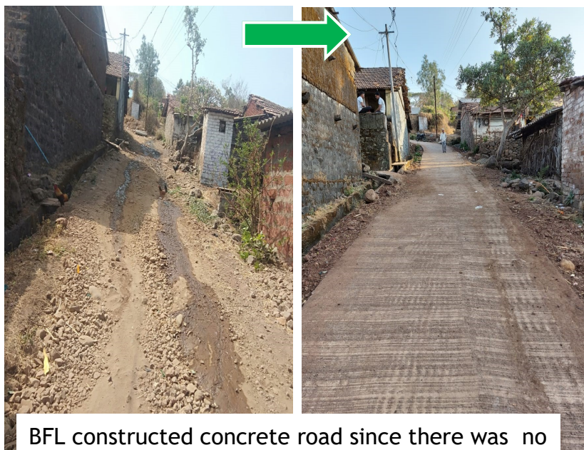
BFL constructed concrete road since there was no accessibility to the School children upto school at Ambavade (it is in remote location)

At Village Peth –Vadgaon - Visited Marathi medium school at peth - vadgaon on 11th Feb. 2020, to understand their needs & review the current situation.