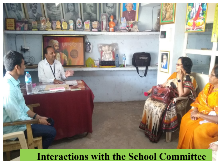
Interactions with the School Committee

At Village Peth –Vadgaon - Visited Marathi medium school at peth - vadgaon on 11th Feb. 2020, to understand their needs & review the current situation.