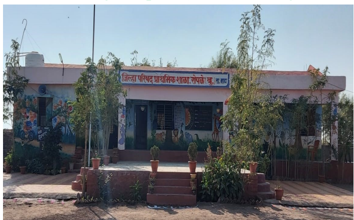
The infrastructure work done by BFL created clean and good learning environment for children

Infrastructure Development & Construction of compound wall work done at Zilha Parishad Primary Schools at village Ropale (khurd), Bedagewasti & Chavanwasti.