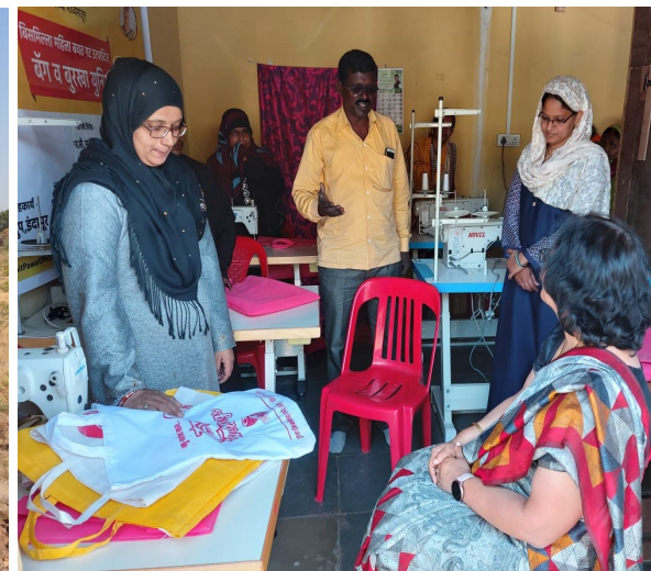
Interactions with SHG staff