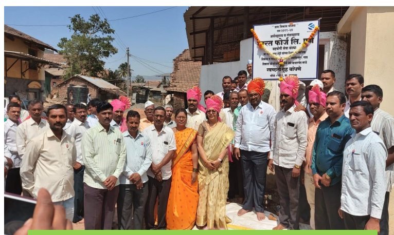
Interactions with villagers at Porle [Thane]