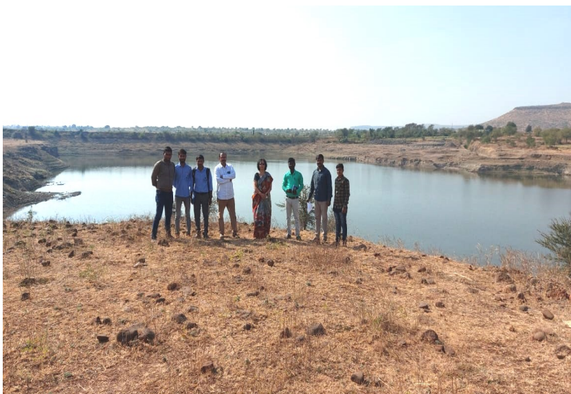
Site visit to Bhutwada Talav