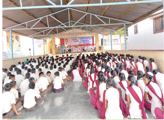
Interactions with villagers & students