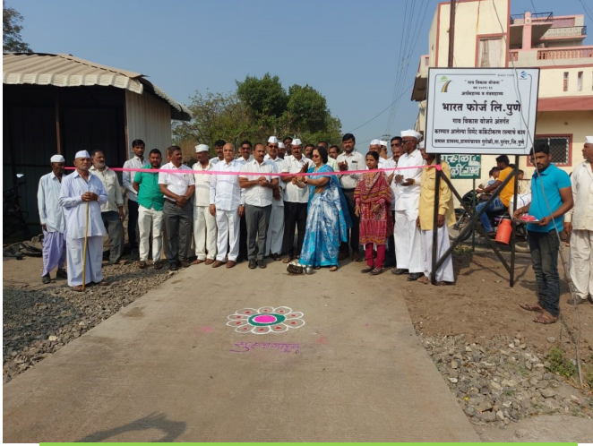
Cement concrete road at Gurholi