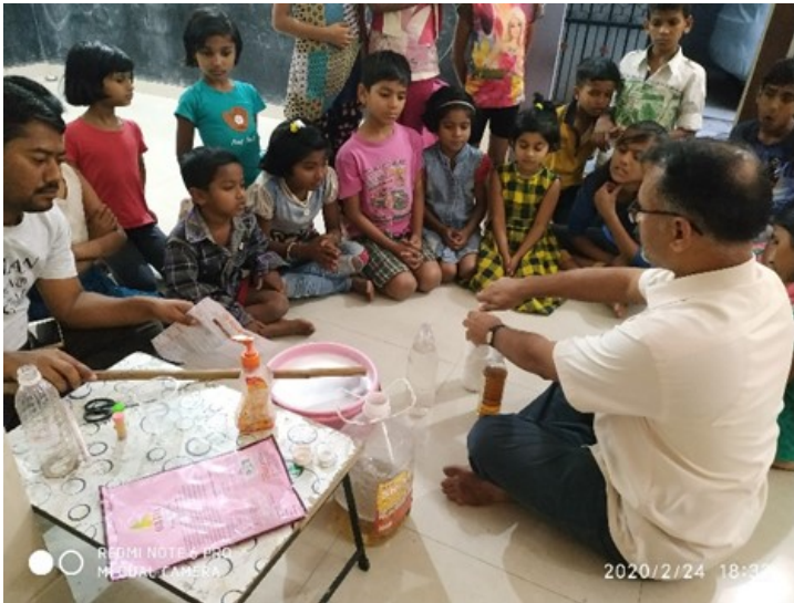
Making Fennel & Liquid soap