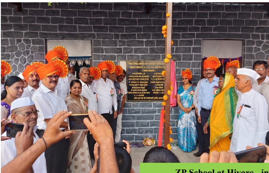
ZP School at Hivare - infrastructure [Roof] work