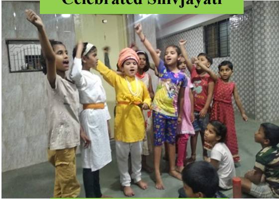
Act on Shiv Jayanti