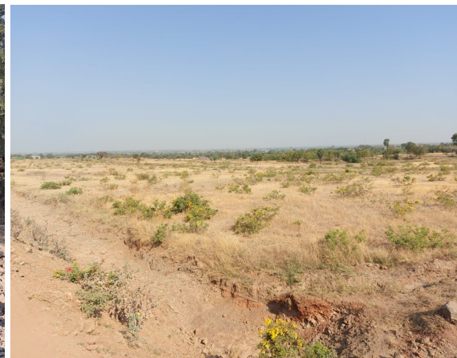
Barren lands at Sonalwadi