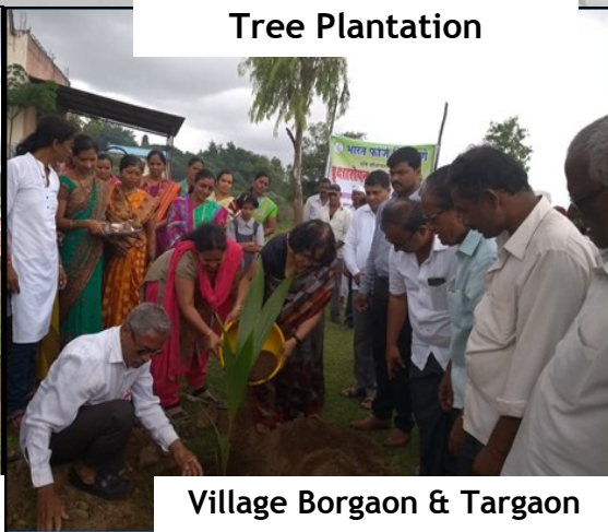
Village Borgaon & Targaon