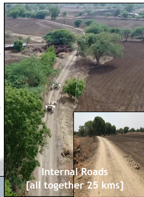
Internal Roads [all together 25 kms]