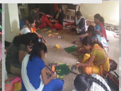
Training on Stitching activities