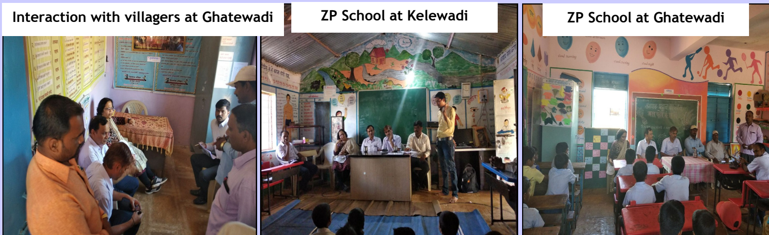
ZP School at Ghatewadi