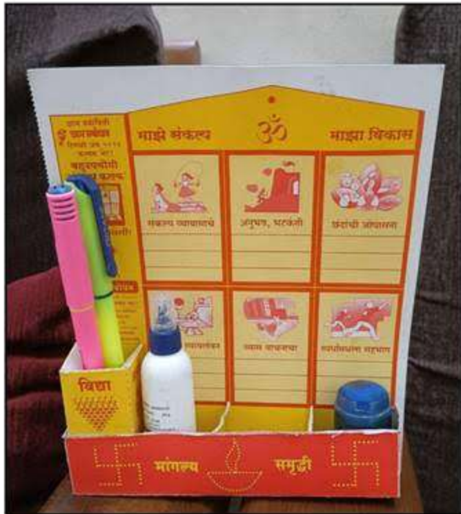
Different activities at the center