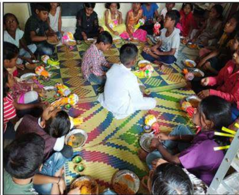
Celebration of Diwali