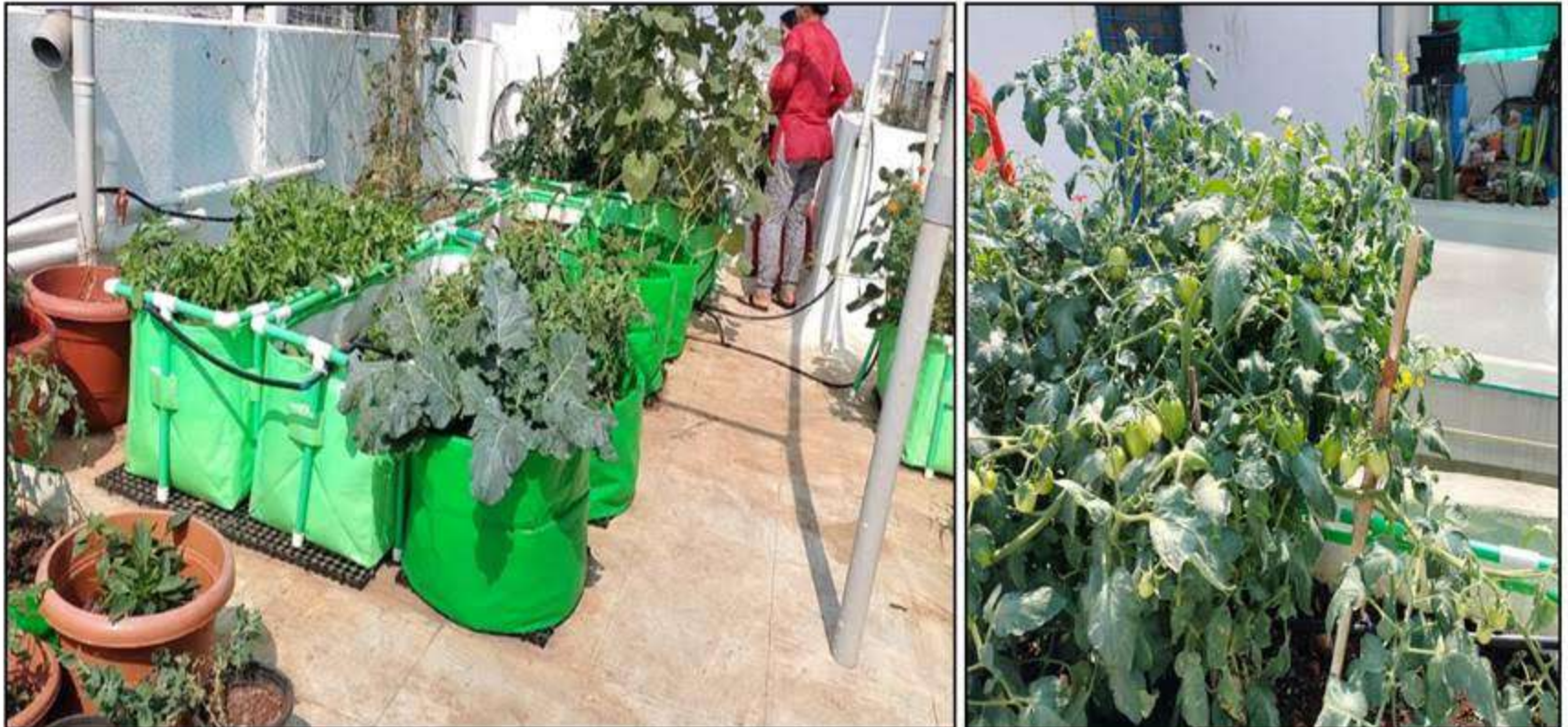
Manure used in the kitchen garden