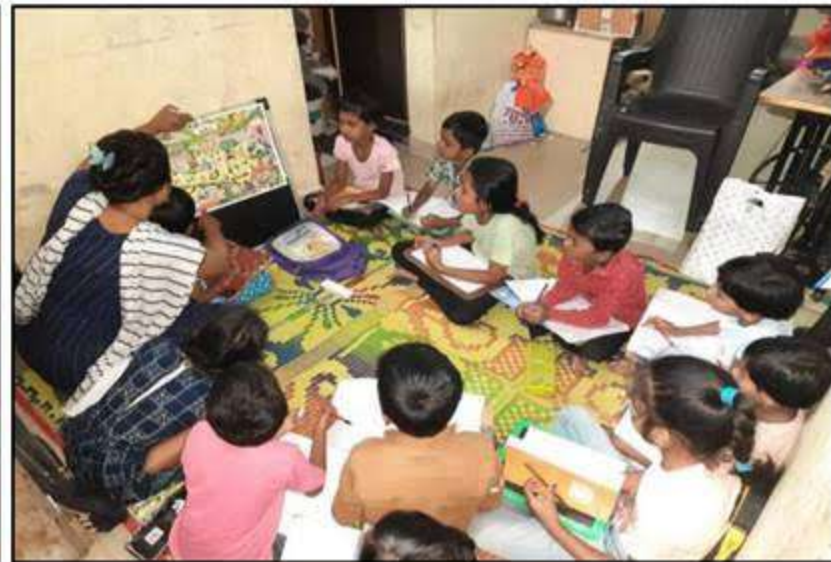
Activities of Balshikshan & Setushikshan