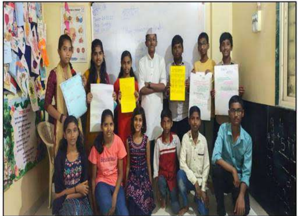
Celebrated the Constitution Day