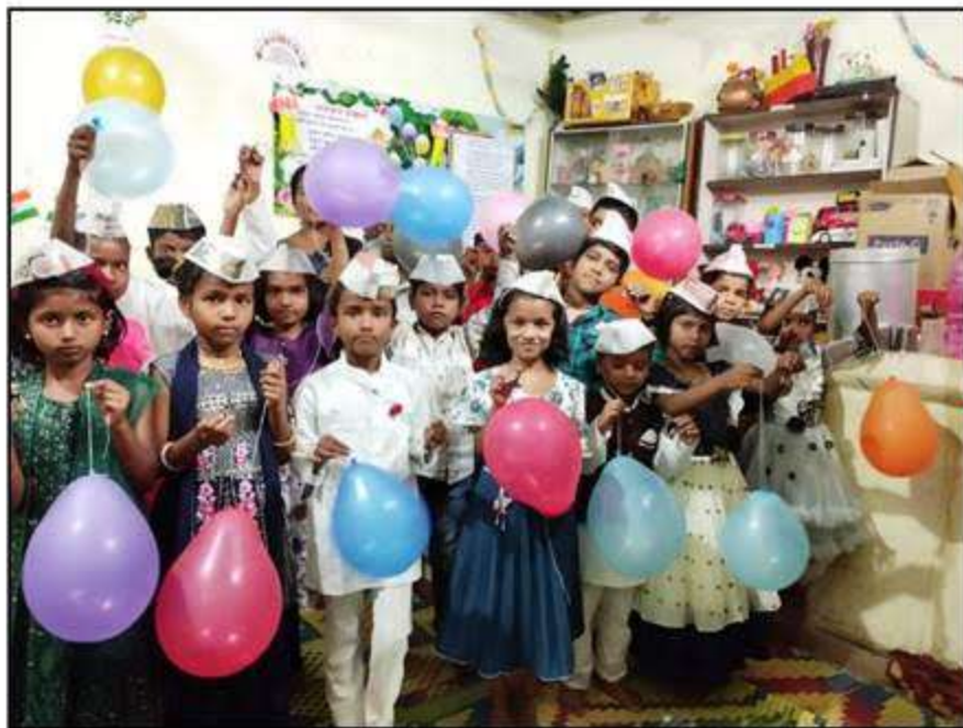
Celebrated the children's day